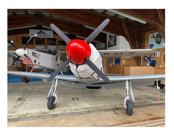
SW-51 Mustang Engine Cover

Covers developed this material combination especially for aircraft protection. The outer material is medium weight and treated for water resistance, UV resistance and anti-static buildup. The inner lining is a very soft and smooth microfiber to prevent scratching. The material is very reflective, and tests show that the cabin interior temperature can be reduced to near-ambient temperature on the hottest of days. It is water, ice and snow repellent, yet breathable to allow moisture to escape from between the cover and the aircraft surface.