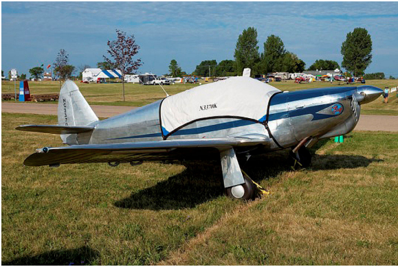
Globe Swift Canopy Cover