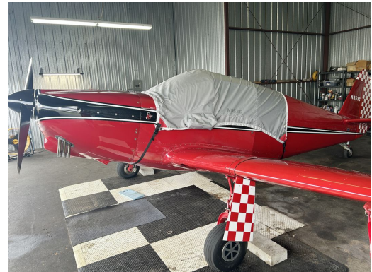
Swift Travel Cover, Light Weight Canopy Cover (Standard Canopy)