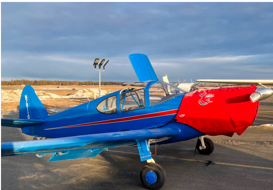
Globe Swift Insulated Engine Cover

This cover type is made from Silver Acrylic Sunbrella canvas and is 100% lined with a soft and smooth microfiber. Bruce's Custom Covers developed this material combination especially for aircraft protection. The outer material is medium weight and treated for water resistance, UV resistance and anti-static buildup. The inner lining is a very soft and smooth microfiber to prevent scratching. The material is very reflective, and tests show that the cabin interior temperature can be reduced to near-ambient temperature on the hottest of days. It is water, ice and snow repellent, yet breathable to allow moisture to escape from between the cover and the aircraft surface.