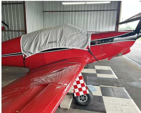
Swift Travel Cover, Light Weight Canopy Cover (Standard Canopy)

Travel Covers are made with Silver Solution-Dyed Polyester fabric and only lined over the windshield to save weight. The material is lightweight and more compact for easy stowage in the aircraft. The polyester material is water resistant, but only intended for occasional use outside. We also have an ultra lightweight material available for fitted hangar dust covers. For daily outdoor use, the non-travel Sunbrella Cover is the best choice.