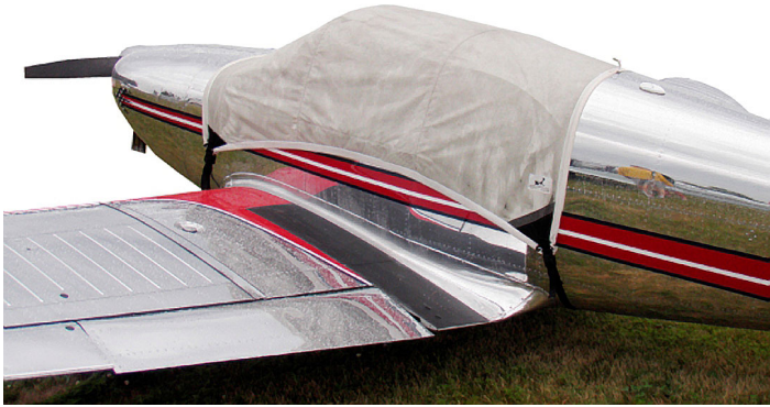
Swift Canopy Cover

This cover type is made from Silver Acrylic Sunbrella canvas and is 100% lined with a soft and smooth microfiber. Bruce's Custom Covers developed this material combination especially for aircraft protection. The outer material is medium weight and treated for water resistance, UV resistance and anti-static buildup. The inner lining is a very soft and smooth microfiber to prevent scratching. The material is very reflective, and tests show that the cabin interior temperature can be reduced to near-ambient temperature on the hottest of days. It is water, ice and snow repellent, yet breathable to allow moisture to escape from between the cover and the aircraft surface.