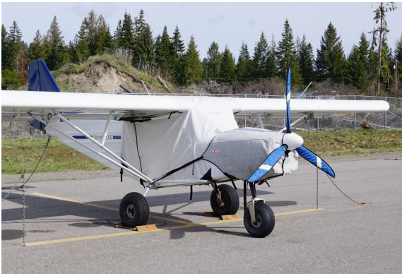
Savannah VG & S Models Canopy Cover, Over Top Type