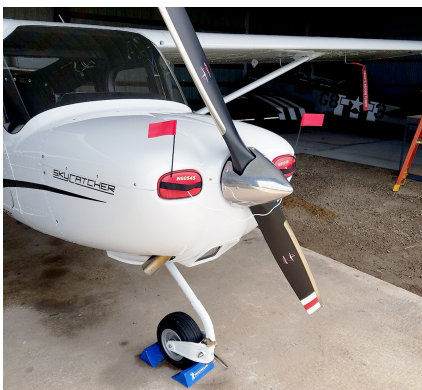
Cessna Skycatcher 162 Engine Inlet Plugs

Engine Inlet Plugs are custom fit for your Savannah VG & S Models intakes, made with heavy-duty vinyl material, and stuffed with a single block of sculpted urethane foam. Each plug has a zipper that allows the foam to be removed and dried if necessary. Engine plugs have warning flags that are visible from the cockpit or 'remove before flight' streamers sewn onto the face of the plugs. Most plugs are imprinted with the aircraft registration number in black for an extra charge. Storage bag NOT included. Engine plugs may be inserted after flight when the engine is still warm. Engine Inlet Plugs are commonly referred to as Cowl Plugs, Intake Plugs, Cowl Blocks, Engine Blocks, and Engine Bungs.