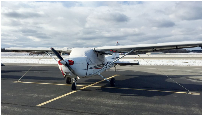
Cessna 172 Engine Plugs and Canopy, Wing, Horizontal Stabilizer Covers