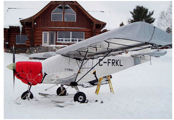
Zenith 801 Insulated Engine, Canopy, Wing & Tail Covers