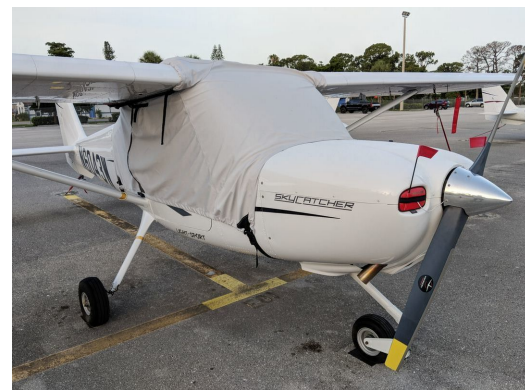
Cessna Skycatcher 162 Canopy Cover and Engine Inlet Plugs