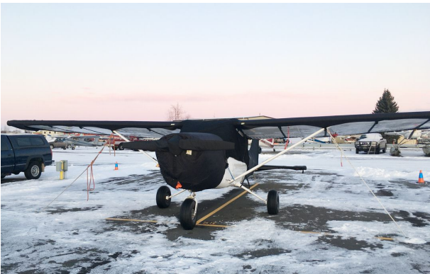
Cessna 172 Canopy, Engine, Prop, Wing & Empennage Covers

WINTER USE MATERIAL - Made with Solution-Dyed Polyester fabric, this option is intended for seasonal use to aid in deicing, rain mitigation, or for occasional travel. The material is lighter and more compact, but more susceptible to UV damage and may have a shorter useful life if used continuously outside than the all-year use material.