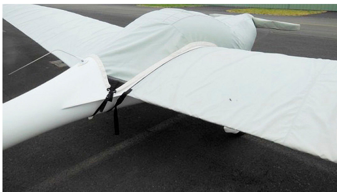
Lambda Canopy/Engine, Wing Covers