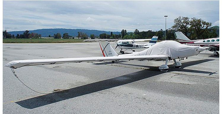
Grob 109 Canopy/Engine w/ extension to tail, Wing, Stabilizer & Prop/Spinner Covers