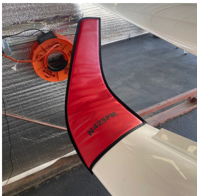
Stemme S-10 & S-12 Wingtip Pads

Designed to prevent damage to the wingtip in crowded hangars or high traffic areas, these products are made of bright red Naugahyde and thickly padded with a sandwich of closed cell foam. Protects delicate winglets, casters and their housings, and soft finishes.