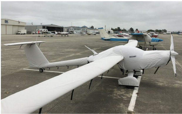
Distar Sundancer LSA Extended Canopy/Engine, Prop, Wheelpants, Wings & Empennage Covers