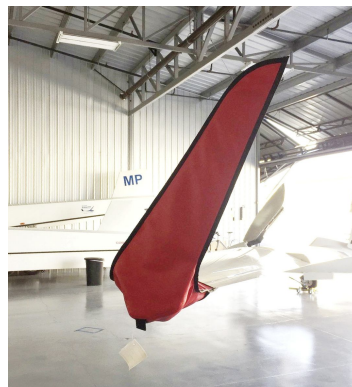
Schleicher ASH Wingtip Pads