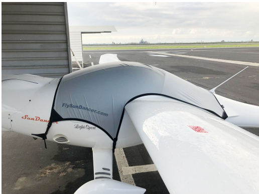
SUNDANCER Travel Cover with custom Imprint