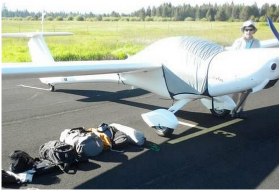
Distar Sundancer Travel Weight Canopy Cover