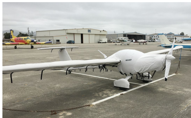
Lambda Canopy/Engine Cover and Wing Covers Distar Sundancer LSA Extended Canopy/Engine, Prop, Wheelpants, Wings & Empennage Covers