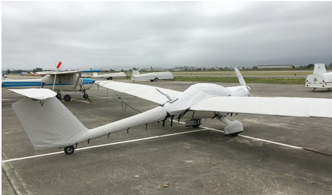
Distar Sundancer LSA Extended Canopy/Engine, Prop, Wheelpants, Wings & Empennage Covers