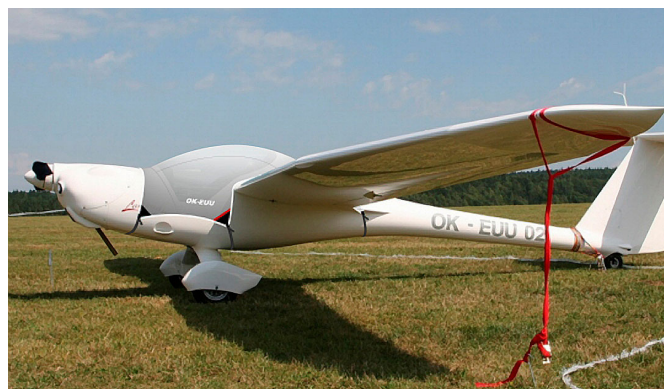
Lambda Canopy Cover (illustration)