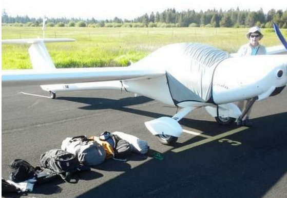
Distar Sundancer Travel Weight Canopy Cover