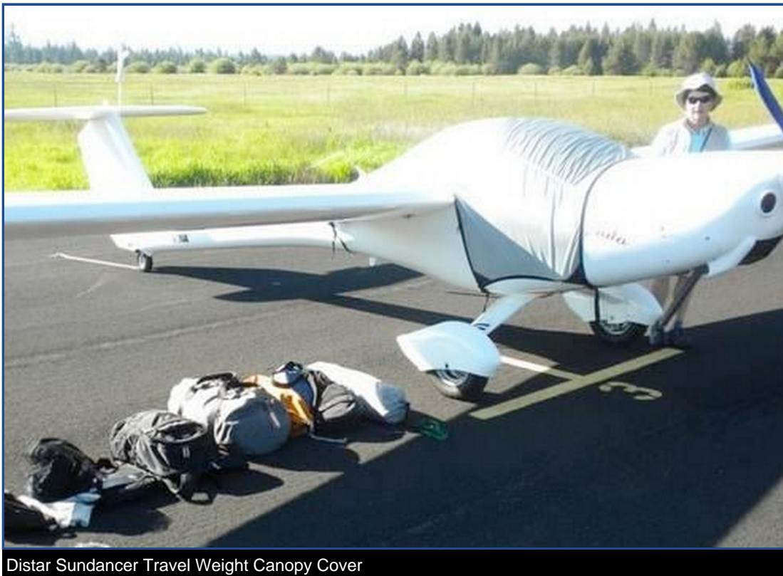
Distar Sundancer Travel Weight Canopy Cover