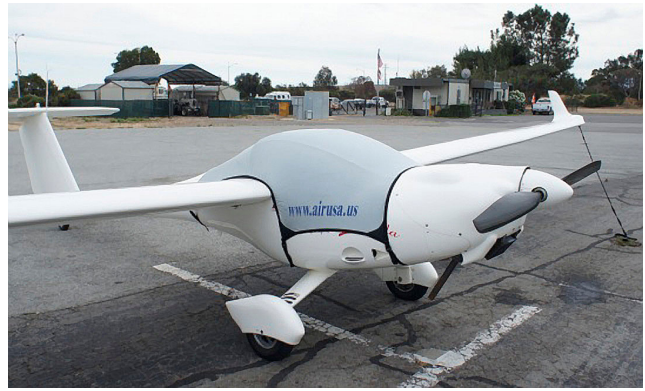
Lambada Travel Canopy Cover