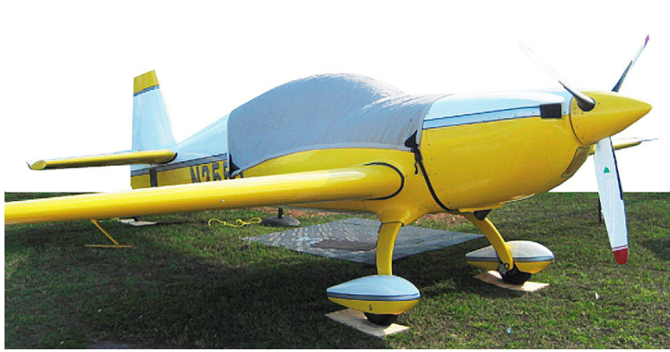
Extra 300/L Canopy Cover