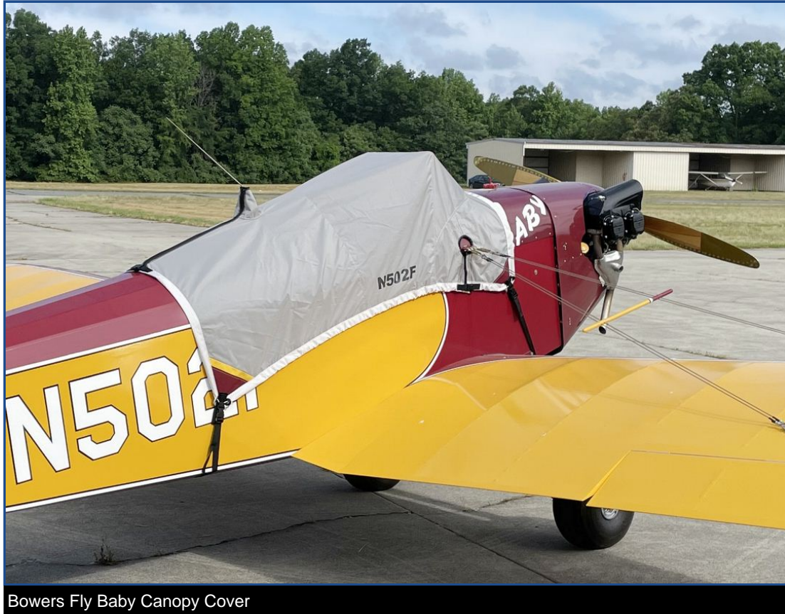
Bowers Fly Baby Canopy Cover