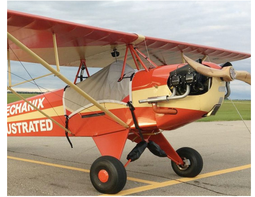
Corben Baby Ace Cockpit Cover