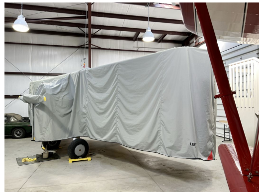
Stearman PT-13 Full Body Dust Cover, Prop Cover Included