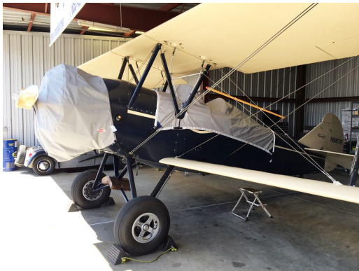
Travel Air 4000 Canopy and Engine Covers, light weight travel type

This cover type is made from Silver Acrylic Sunbrella canvas and is 100% lined with a soft and smooth microfiber. Bruce's Custom Covers developed this material combination especially for aircraft protection. The outer material is medium weight and treated for water resistance, UV resistance and anti-static buildup. The inner lining is a very soft and smooth microfiber to prevent scratching. The material is very reflective, and tests show that the cabin interior temperature can be reduced to near-ambient temperature on the hottest of days. It is water, ice and snow repellent, yet breathable to allow moisture to escape from between the cover and the aircraft surface.