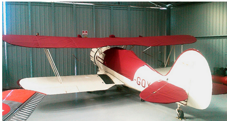
Waco UPF-7 Upper Wing Cover, Horizontal Stabilizer Cover & Canopy Cover

WINTER USE MATERIAL - Made with Solution-Dyed Polyester fabric, this option is intended for seasonal use to aid in deicing, rain mitigation, or for occasional travel. The material is lighter and more compact, but more susceptible to UV damage and may have a shorter useful life if used continuously outside than the all-year use material.