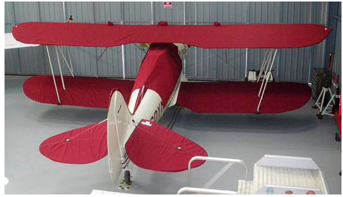
Waco UPF-7 Upper/Lower Wing Cover, Horizontal Stabilizer Cover, & Canopy Cover