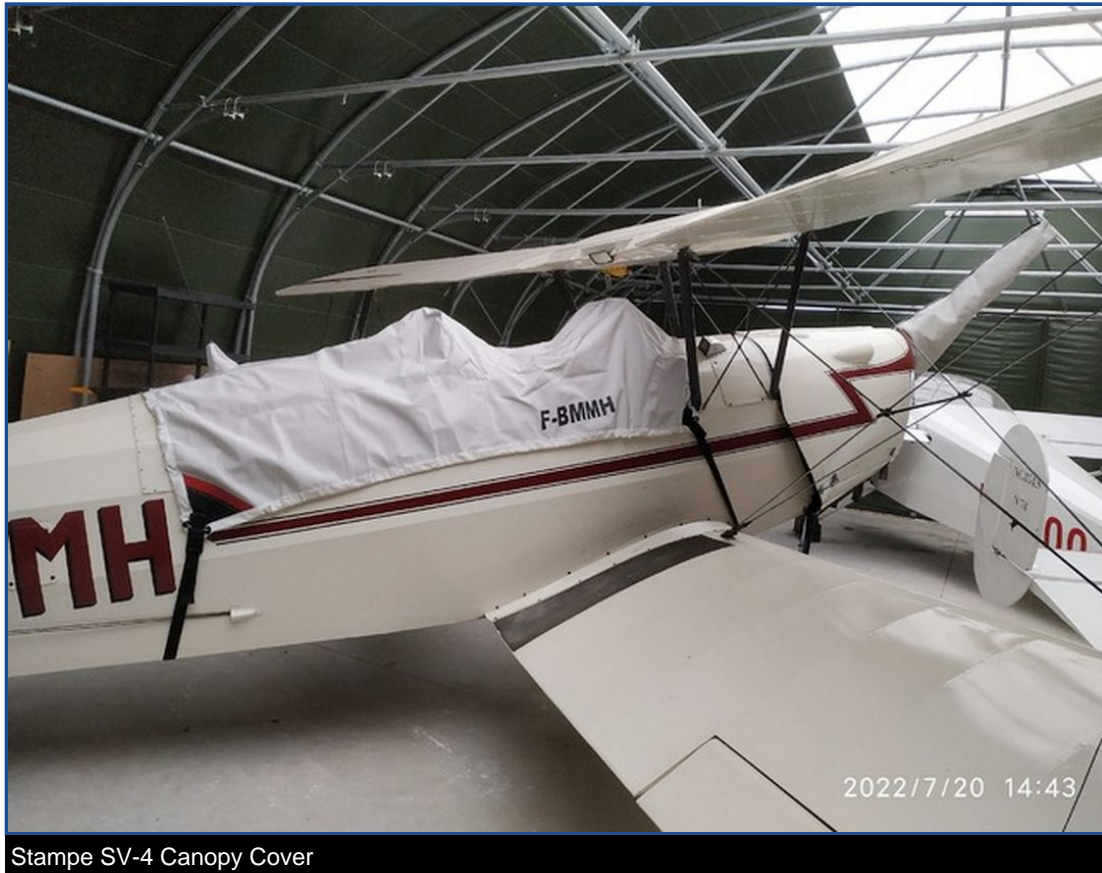
Stampe SV-4 Canopy Cover