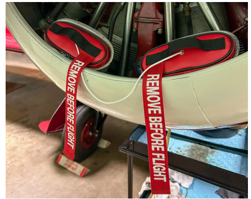
Beech Staggerwing Carb Inlet Plugs, Located Inside Engine