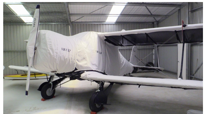
Beech Staggerwing Complete Cover Set