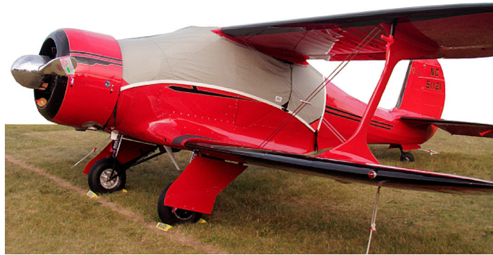
Beech Staggerwing Canopy Cover

Travel Covers are made with Silver Solution-Dyed Polyester fabric and only lined over the windshield to save weight. The material is lightweight and more compact for easy stowage in the aircraft. The polyester material is water resistant, but only intended for occasional use outside. We also have an ultra lightweight material available for fitted hangar dust covers. For daily outdoor use, the non-travel Sunbrella Cover is the best choice.