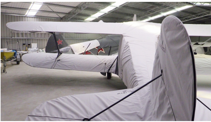
Beech Staggerwing Complete Cover Set