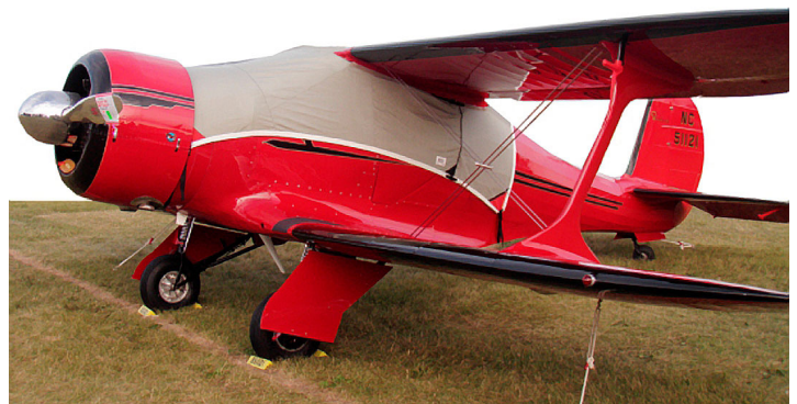
Beech Staggerwing Canopy Cover