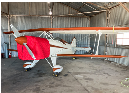
SKYBOLT, Insulated Hangar Blanket, Custom Fit Interior Use)

This cover type is made from Silver Acrylic Sunbrella canvas and is 100% lined with a soft and smooth microfiber. Bruce's Custom Covers developed this material combination especially for aircraft protection. The outer material is medium weight and treated for water resistance, UV resistance and anti-static buildup. The inner lining is a very soft and smooth microfiber to prevent scratching. The material is very reflective, and tests show that the cabin interior temperature can be reduced to near-ambient temperature on the hottest of days. It is water, ice and snow repellent, yet breathable to allow moisture to escape from between the cover and the aircraft surface.