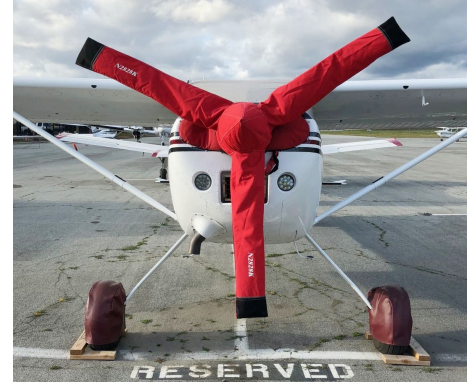
Cessna Skywagon Propellor/Spinner Cover, 3-blade type