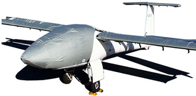
Stemme S-10 Wing Covers & Horiz. Stab. Covers

WINTER USE MATERIAL - Made with Solution-Dyed Polyester fabric, this option is intended for seasonal use to aid in deicing, rain mitigation, or for occasional travel. The material is lighter and more compact, but more susceptible to UV damage and may have a shorter useful life if used continuously outside than the all-year use material.