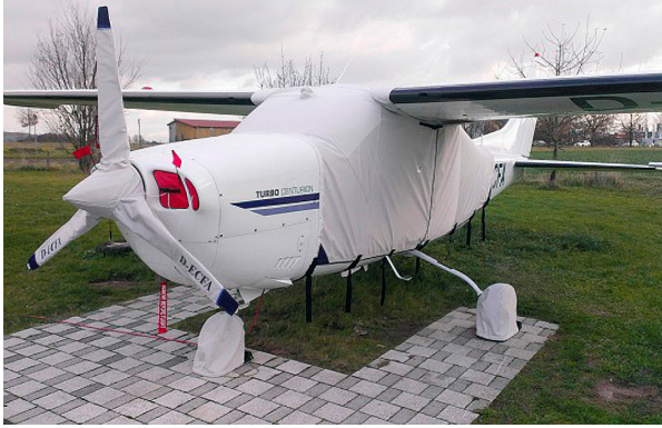
Cessna 210 Extended Canopy Cover, Engine Plugs, Prop and Tire Covers