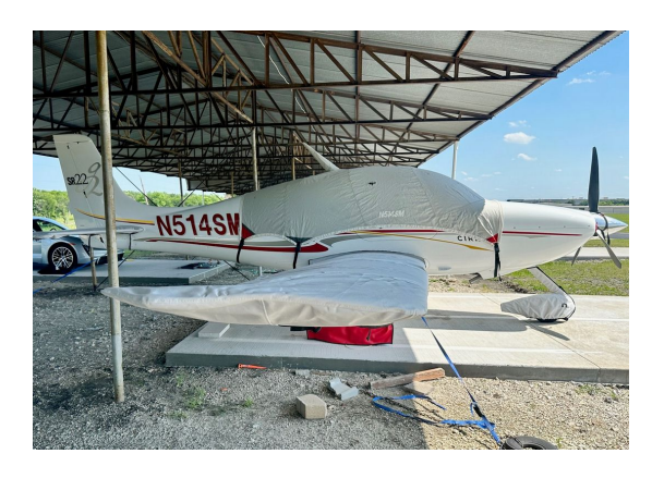
Cirrus SR-22 Canopy, Wing & Wheelpant Covers