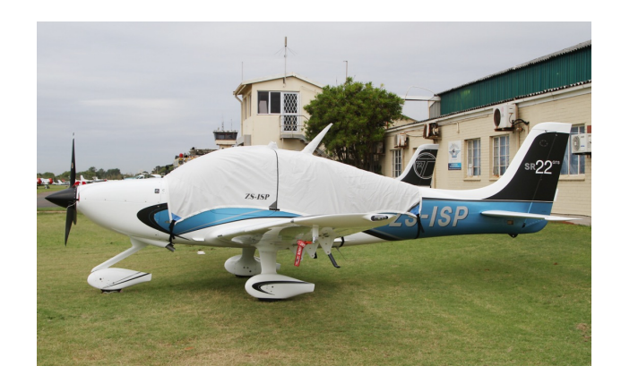
Cirrus SR-22 Canopy Cover