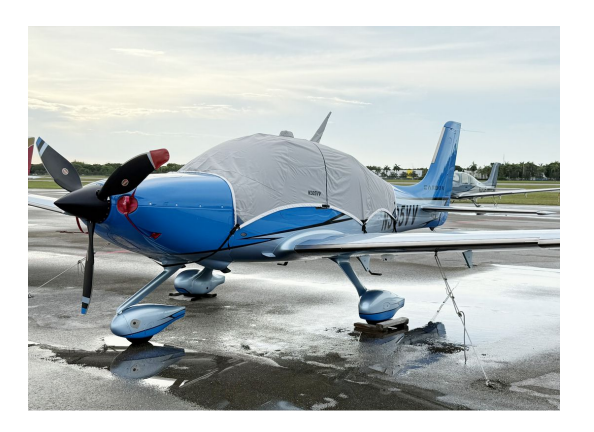
Cirrus SR-22T Canopy Cover, Travel Weight