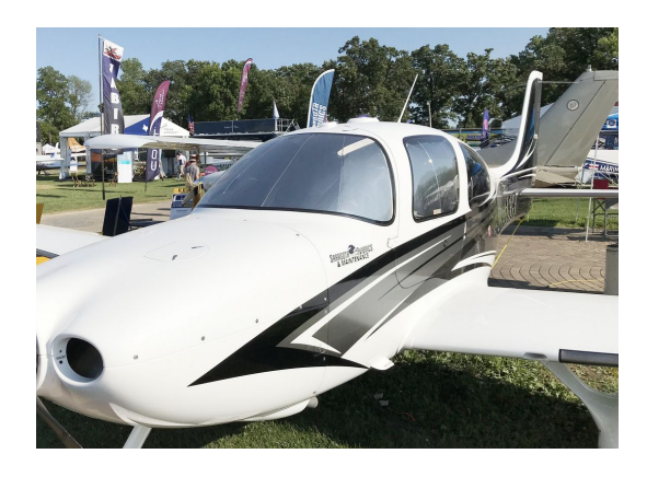
Cirrus SR-22 Cockpit HeatShields

Windshield Heatshields are interior sunshades for an aircraft's front windshield. The product is a unique composite of closed-cell foam with a silver mylar finish. The semi-rigid design is stiff enough to stand along the inside of the windshield using sun visors or window framing. It folds up flat and easily stores in the included storage sleeve. Some designs may require velcro and suction cups or split right and left sides. A Heatshield is an excellent short-term remedy for cockpit overheating. An external fabric cover is far more effective and practical for long-term protection.