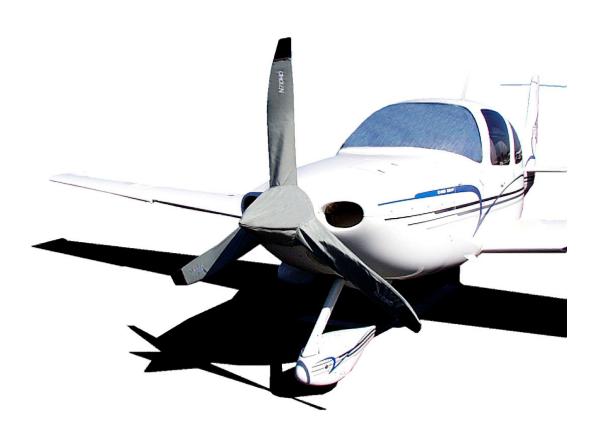
Cirrus SR-22 Propellor/Spinner Cover & Windshield Heatshield