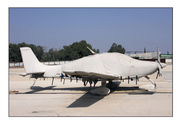
Cirrus SR-22 Full Cover Set