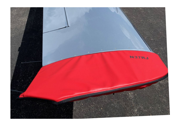
Cirrus SR-22 Wingtip Pads

Designed to prevent damage to the aircraft extremities in crowded hangars, these products are made of bright red Naugahyde and thickly padded with a sandwich of closed cell foam.