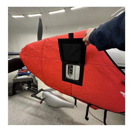
Cirrus SR-22 Insulated Engine Cover