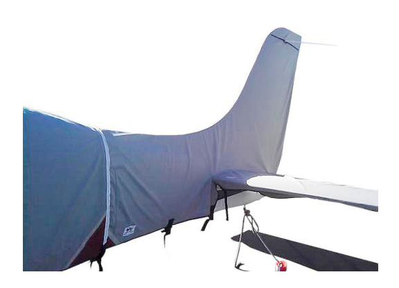
Cirrus SR20 Empennage Cover (covers tail boom, vertical and horizontal stabilizers)

WINTER USE MATERIAL - Made with Solution-Dyed Polyester fabric, this option is intended for seasonal use to aid in deicing, rain mitigation, or for occasional travel. The material is lighter and more compact, but more susceptible to UV damage and may have a shorter useful life if used continuously outside than the all-year use material.