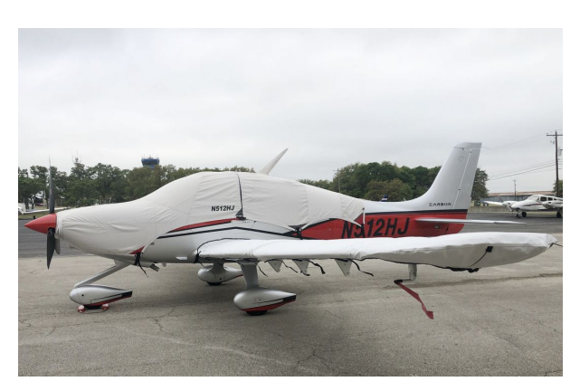
Cirrus SR-22 Canopy/Engine & Wing Covers