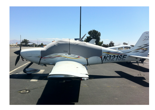
Cirrus SR-22 Light Weight Travel Cover

This cover type is made from Silver Acrylic Sunbrella canvas and is 100% lined with a soft and smooth microfiber. Bruce's Custom Covers developed this material combination especially for aircraft protection. The outer material is medium weight and treated for water resistance, UV resistance and anti-static buildup. The inner lining is a very soft and smooth microfiber to prevent scratching. The material is very reflective, and tests show that the cabin interior temperature can be reduced to near-ambient temperature on the hottest of days. It is water, ice and snow repellent, yet breathable to allow moisture to escape from between the cover and the aircraft surface.