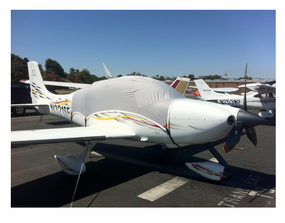
Cirrus Light Weight Travel Canopy Cover