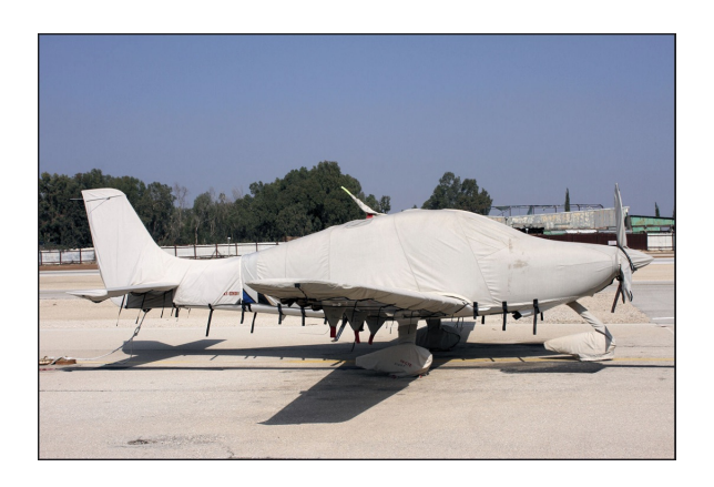
Cirrus SR-22 Full Cover Set