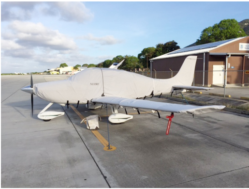
Cirrus SR-22 Full Cover Set