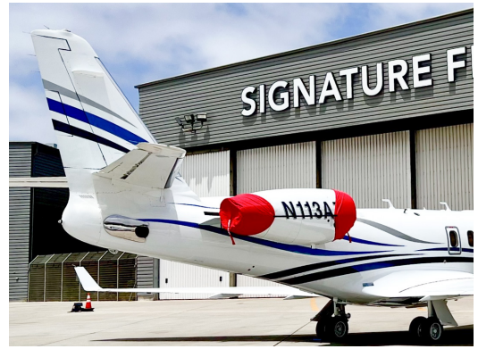
IAI Astra SPX Engine Covers