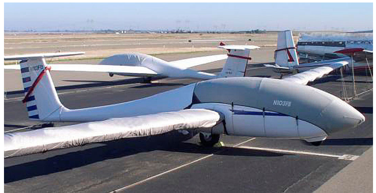
Grob 103 Canopy/Nose & Wing Covers