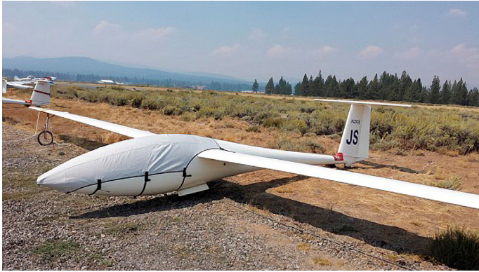
ASW-20C Canopy/Nose Cover

This cover type is made from Silver Acrylic Sunbrella canvas and is 100% lined with a soft and smooth microfiber. Bruce's Custom Covers developed this material combination especially for aircraft protection. The outer material is medium weight and treated for water resistance, UV resistance and anti-static buildup. The inner lining is a very soft and smooth microfiber to prevent scratching. The material is very reflective, and tests show that the cabin interior temperature can be reduced to near-ambient temperature on the hottest of days. It is water, ice and snow repellent, yet breathable to allow moisture to escape from between the cover and the aircraft surface.