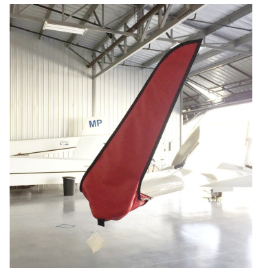
Schleicher ASH Wingtip Pads