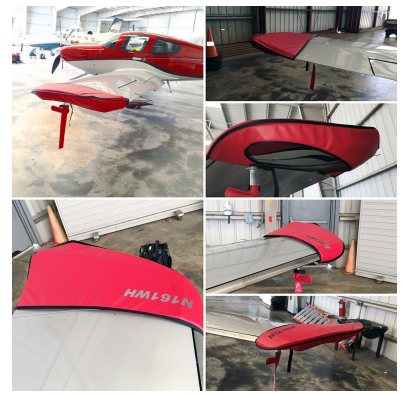
Cirrus SR22 Wingtip Pads, G5 Models