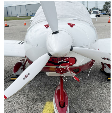
SportCruiser Engine Inlet Plugs