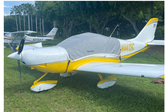
SportCruiser Travel Canopy Cover