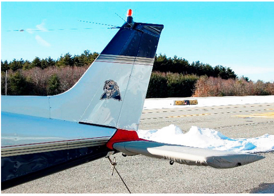
Tailcone & Horizontal Stabilizer Covers