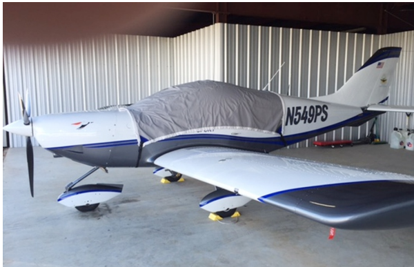
PiperSport Light Weight Travel Cover

Travel Covers are made with Silver Solution-Dyed Polyester fabric and only lined over the windshield to save weight. The material is lightweight and more compact for easy stowage in the aircraft. The polyester material is water resistant, but only intended for occasional use outside. We also have an ultra lightweight material available for fitted hangar dust covers. For daily outdoor use, the non-travel Sunbrella Cover is the best choice.