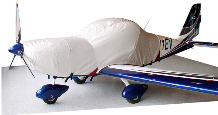
Evezektor Sportstar Extended Canopy/Engine Cover

This cover type is made from Silver Acrylic Sunbrella canvas and is 100% lined with a soft and smooth microfiber. Bruce's Custom Covers developed this material combination especially for aircraft protection. The outer material is medium weight and treated for water resistance, UV resistance and anti-static buildup. The inner lining is a very soft and smooth microfiber to prevent scratching. The material is very reflective, and tests show that the cabin interior temperature can be reduced to near-ambient temperature on the hottest of days. It is water, ice and snow repellent, yet breathable to allow moisture to escape from between the cover and the aircraft surface.