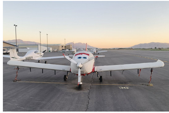
SportCruiser Canopy/Engine & Wing Covers