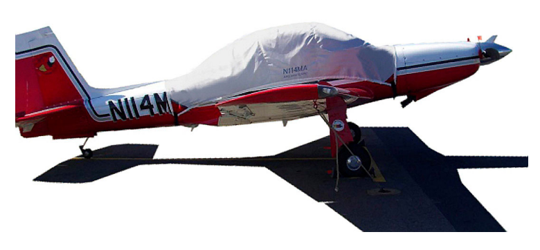
Micco SP20 Canopy Cover & Engine Inlet Plugs