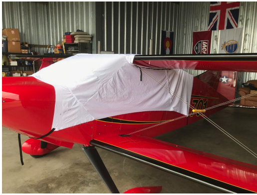
Sorrell Hiperbipe Canopy Cover (test fit cover)