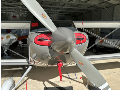
SNS-7 HiperBipe Engine Inlet Plugs

Engine Inlet Plugs are custom fit for your Sorrell Hiperbipe SNS-7 intakes, made with heavy-duty vinyl material, and stuffed with a single block of sculpted urethane foam. Each plug has a zipper that allows the foam to be removed and dried if necessary. Engine plugs have warning flags that are visible from the cockpit or 'remove before flight' streamers sewn onto the face of the plugs. Most plugs are imprinted with the aircraft registration number in black for an extra charge. Storage bag NOT included. Engine plugs may be inserted after flight when the engine is still warm. Engine Inlet Plugs are commonly referred to as Cowl Plugs, Intake Plugs, Cowl Blocks, Engine Blocks, and Engine Bungs.