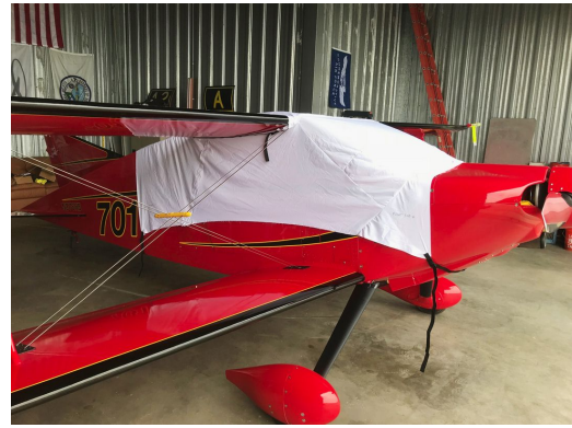
Sorrell Hiperbipe Canopy Cover (test fit cover)