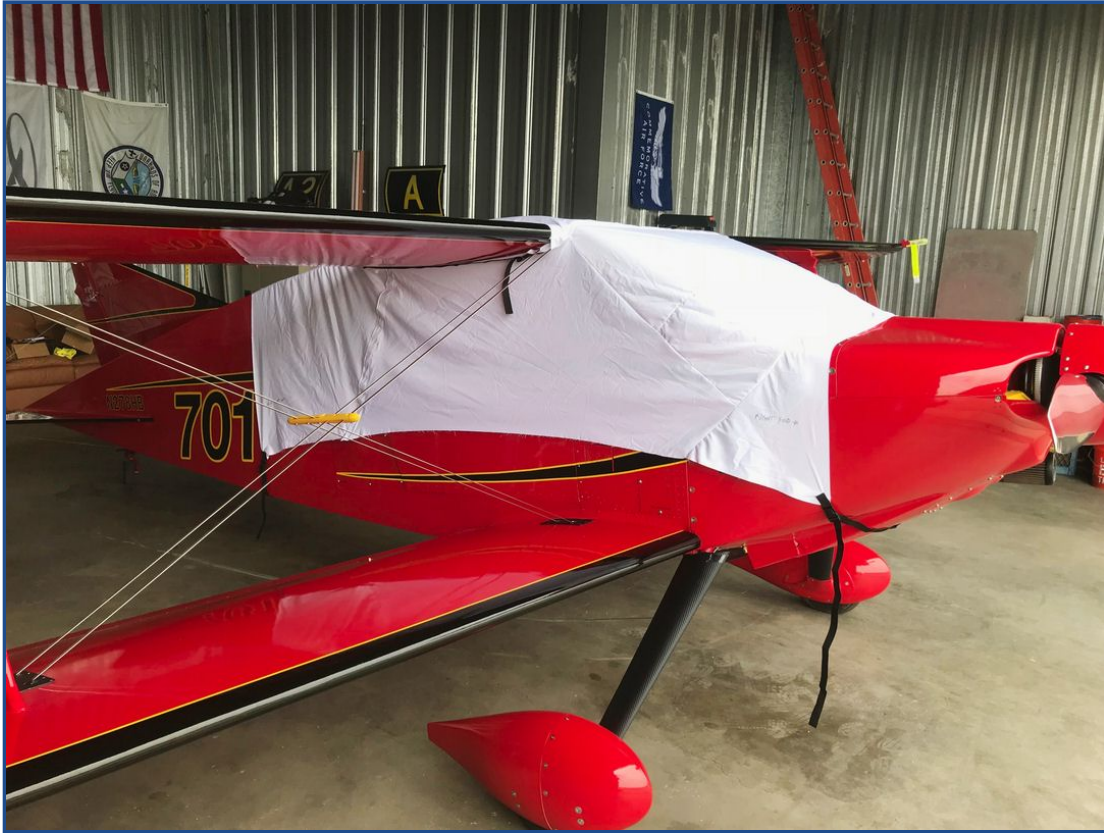
Sorrell Hiperbipe Canopy Cover (test fit cover)