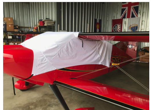
Sorrell Hiperbipe Canopy Cover (test fit cover)