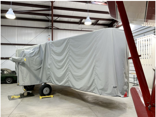
Stearman PT-13 Full Body Dust Cover, Prop Cover Included