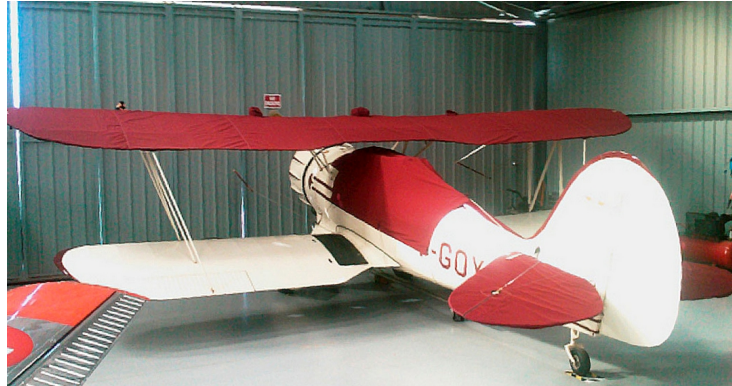
Waco UPF-7 Upper Wing Cover, Horizontal Stabilizer Cover & Canopy Cover

WINTER USE MATERIAL - Made with Solution-Dyed Polyester fabric, this option is intended for seasonal use to aid in deicing, rain mitigation, or for occasional travel. The material is lighter and more compact, but more susceptible to UV damage and may have a shorter useful life if used continuously outside than the all-year use material.