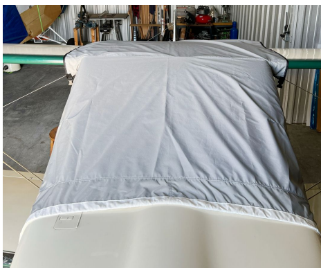
Sorrell SNS-7 Hiperbipe Over The Top Travel Canopy Cover

Travel Covers are made with Silver Solution-Dyed Polyester fabric and only lined over the windshield to save weight. The material is lightweight and more compact for easy stowage in the aircraft. The polyester material is water resistant, but only intended for occasional use outside. We also have an ultra lightweight material available for fitted hangar dust covers. For daily outdoor use, the non-travel Sunbrella Cover is the best choice.