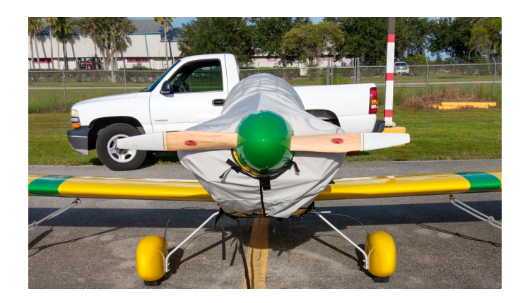
Sonerai Racer Engine Cover

The material is very reflective, and tests show that the cabin interior temperature can be reduced to near-ambient temperature on the hottest of days. It is water, ice and snow repellent, yet breathable to allow moisture to escape from between the cover and the aircraft surface.