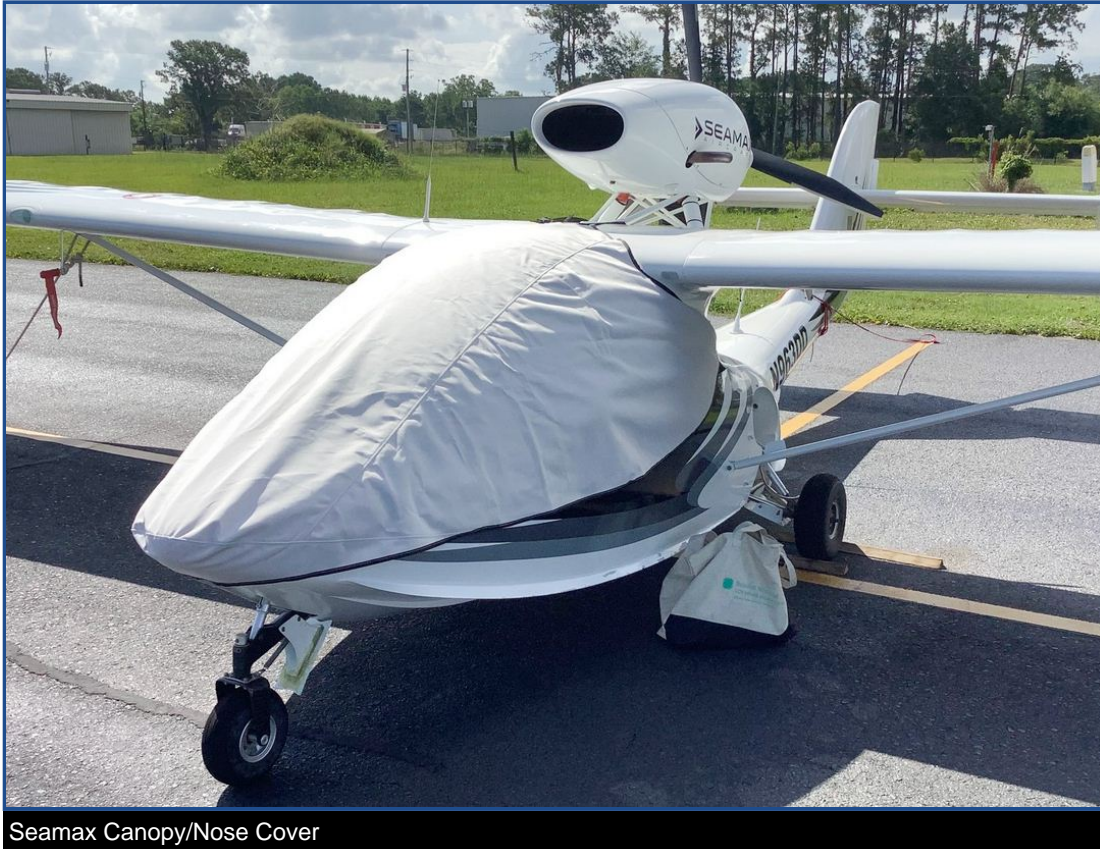
Seamax Canopy/Nose Cover