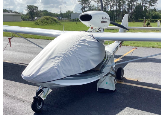
Seamax Canopy/Nose Cover