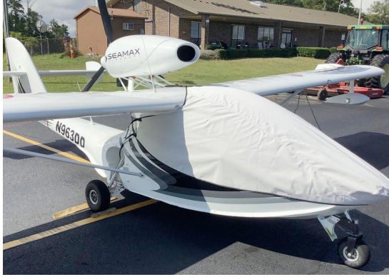
Seamax Canopy/Nose Cover

The material is very reflective, and tests show that the cabin interior temperature can be reduced to near-ambient temperature on the hottest of days. It is water, ice and snow repellent, yet breathable to allow moisture to escape from between the cover and the aircraft surface.