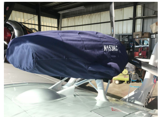
Seamax M22 Engine Cover