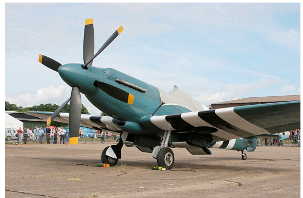
Supermarine Spitfire XIX Canopy Cover