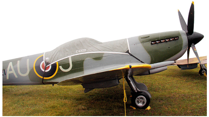
Supermarine Spitfire Mark 16 Canopy Cover