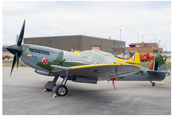
Supermarine Spitfire Mk 14 Canopy Cover