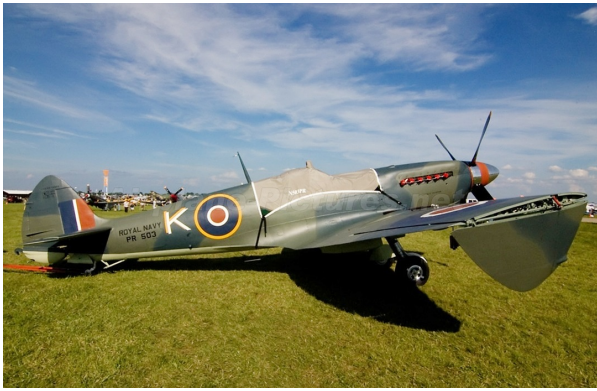
Supermarine Spitfire Mk IX Canopy Cover