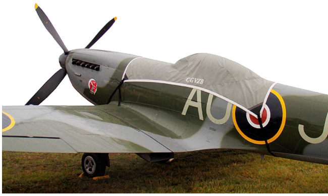
Supermarine Spitfire Mark 16 Canopy Cover