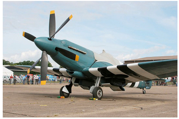
Supermarine Spitfire XIX Canopy Cover