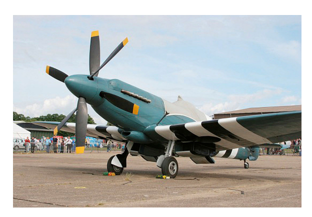
Supermarine Spitfire XIX Canopy Cover