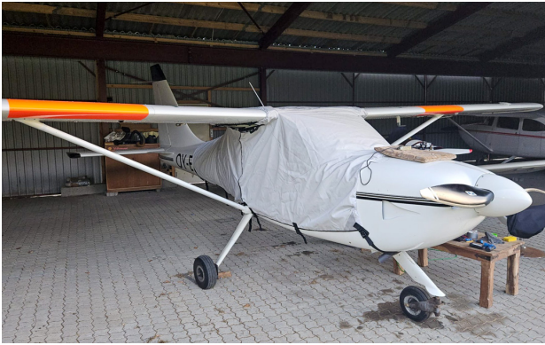
Glstar Sportsman GS2 Extended Canopy Cover, over top type

water resistance, UV resistance and anti-static buildup. The inner lining is a very soft and smooth microfiber to prevent scratching. The material is very reflective, and tests show that the cabin interior temperature can be reduced to near-ambient temperature on the hottest of days. It is water, ice and snow repellent, yet breathable to allow moisture to escape from between the cover and the aircraft surface.