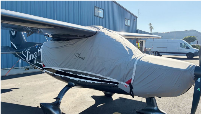
Sling High Wing Canopy Cover & Engine Cover

This cover type is made from Silver Acrylic Sunbrella canvas and is 100% lined with a soft and smooth microfiber. Bruce's Custom Covers developed this material combination especially for aircraft protection. The outer material is medium weight and treated for water resistance, UV resistance and anti-static buildup. The inner lining is a very soft and smooth microfiber to prevent scratching. The material is very reflective, and tests show that the cabin interior temperature can be reduced to near-ambient temperature on the hottest of days. It is water, ice and snow repellent, yet breathable to allow moisture to escape from between the cover and the aircraft surface.