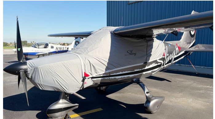
Sling High Wing Canopy Cover & Engine Cover