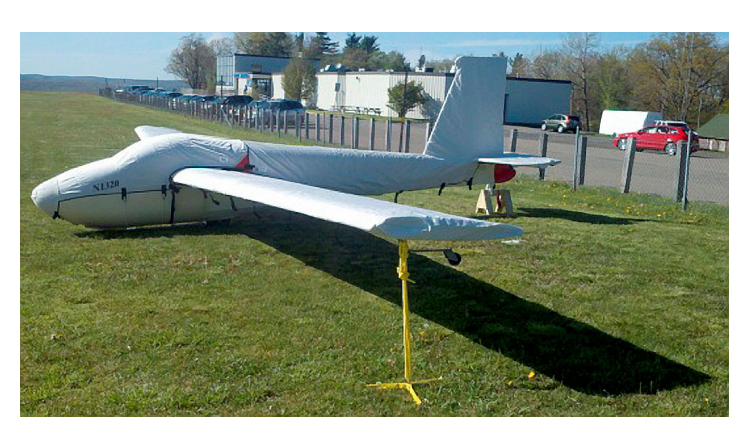
SGS 1-26B Canopy/Nose, Empennage & Wing Covers