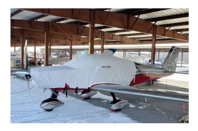
Airplane Factory Sling TSI Extended Canopy/Engine Cover