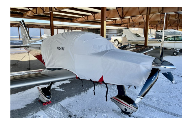
Airplane Factory Sling TSI Extended Canopy/Engine Cover

This cover type is made from Silver Acrylic Sunbrella canvas and is 100% lined with a soft and smooth microfiber. Bruce's Custom Covers developed this material combination especially for aircraft protection. The outer material is medium weight and treated for water resistance, UV resistance and anti-static buildup. The inner lining is a very soft and smooth microfiber to prevent scratching. The material is very reflective, and tests show that the cabin interior temperature can be reduced to near-ambient temperature on the hottest of days. It is water, ice and snow repellent, yet breathable to allow moisture to escape from between the cover and the aircraft surface.