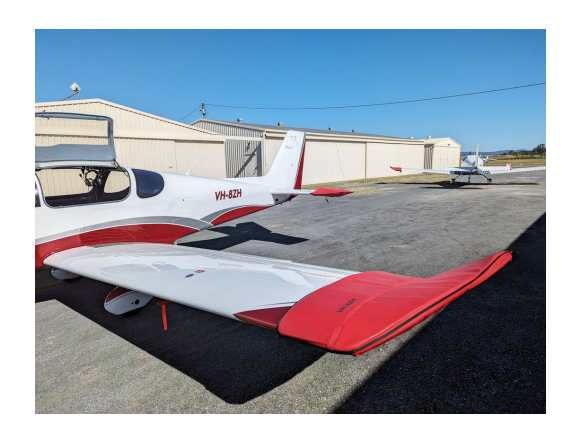
Sling TSI Wing & Horizontal Stabilizer Tip Pads