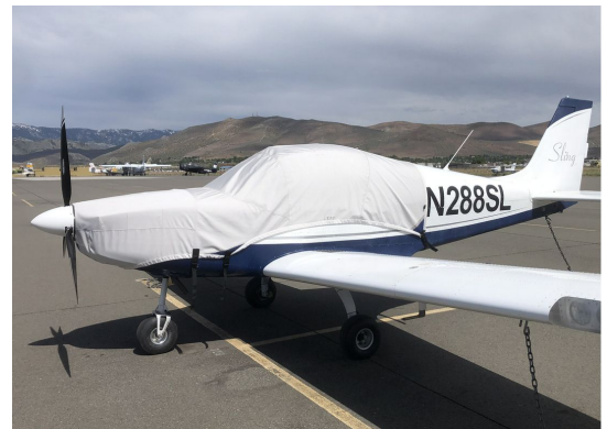
Sling 2 Canopy/Engine Cover