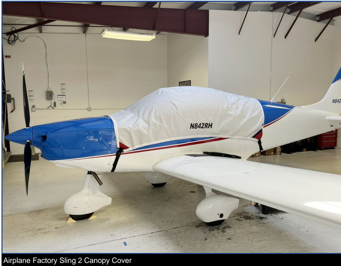
Airplane Factory Sling 2 Canopy Cover