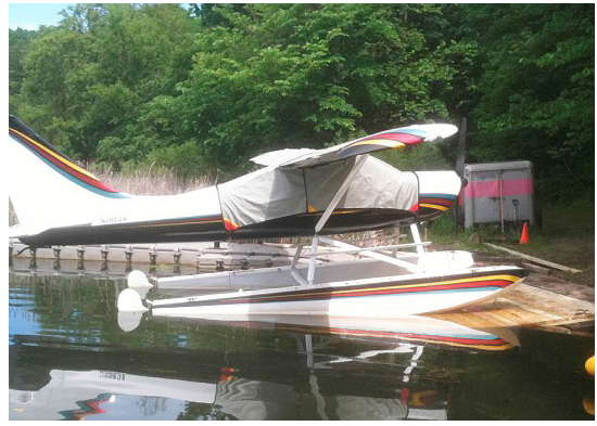
Glastar Sportsman Canopy Cover