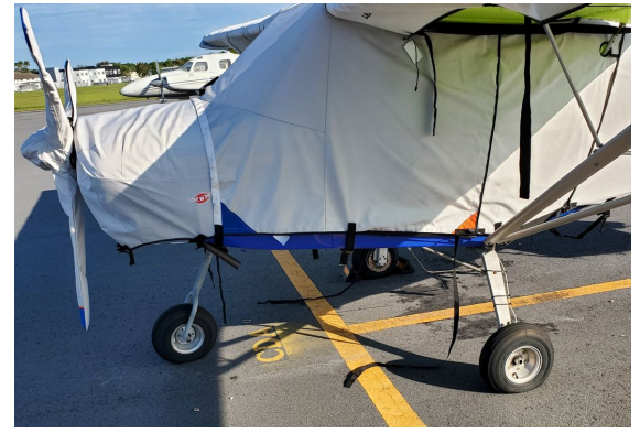
Best Off Skyranger Complete Cover Set