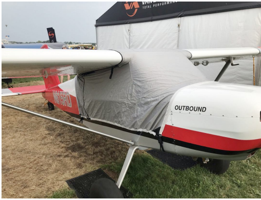
Rans S-21 Travel Canopy Cover