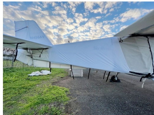
Best Off Skyranger Empennage Cover, test fit cover