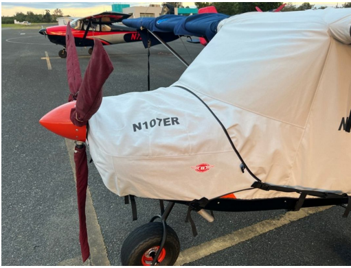
Best Off Skyranger Canopy Cover, Engine Cover