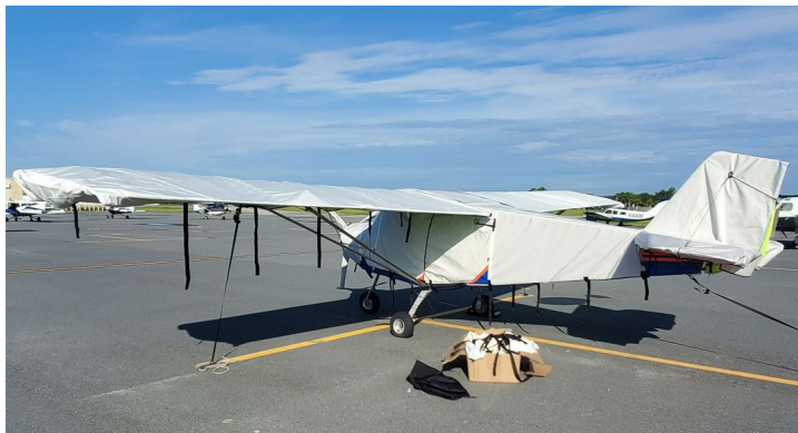
Best Off Skyranger Complete Cover Set

WINTER USE MATERIAL - Made with Solution-Dyed Polyester fabric, this option is intended for seasonal use to aid in deicing, rain mitigation, or for occasional travel. The material is lighter and more compact, but more susceptible to UV damage and may have a shorter useful life if used continuously outside than the all-year use material.