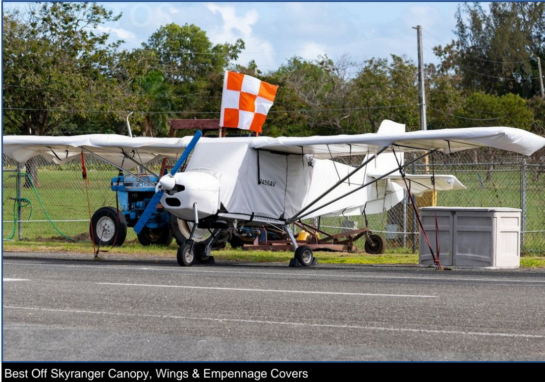
Best Off Skyranger Canopy, Wings &amp; Empennage Covers