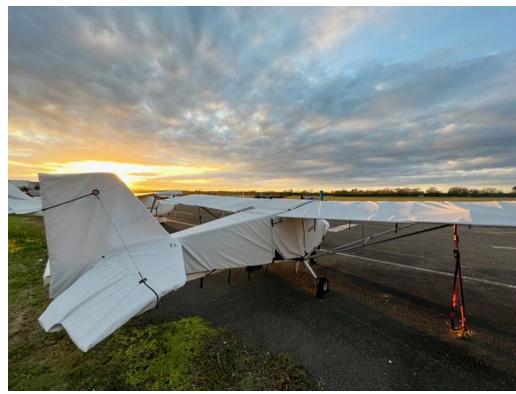
Best Off Skyranger Canopy, Wing & Empennage Covers