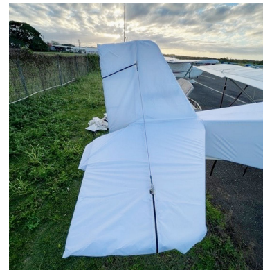
Best Off Skyranger Empennage Cover, test fit cover