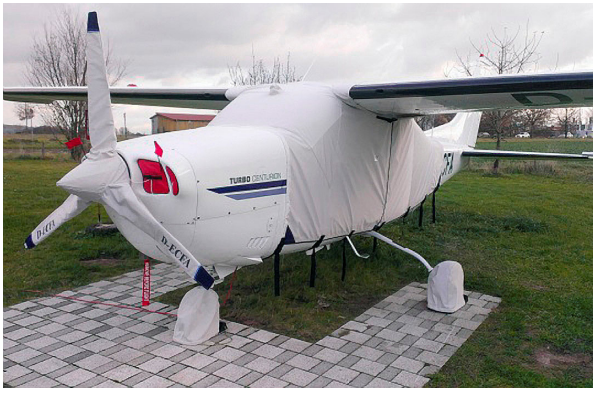
Cessna 210 Extended Canopy Cover, Engine Plugs, Prop and Tire Covers