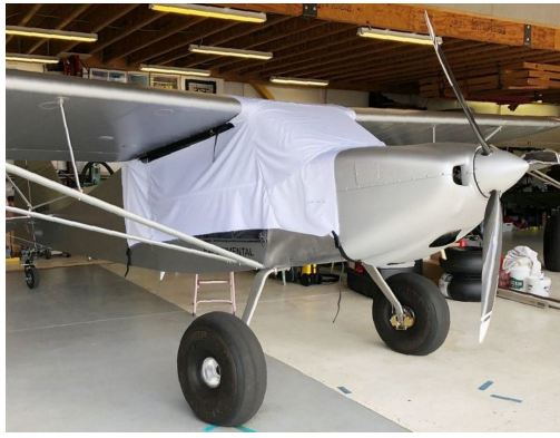
Rans S-20 Canopy Cover, test fit cover