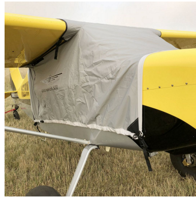
Rans S-20 Raven Travel Cover, Light Weight Travel Canopy Cover