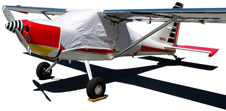
Glstar Over-Top Canopy Cover