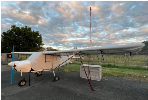
Best Off Skyranger Canopy & Wing Covers

WINTER USE MATERIAL - Made with Solution-Dyed Polyester fabric, this option is intended for seasonal use to aid in deicing, rain mitigation, or for occasional travel. The material is lighter and more compact, but more susceptible to UV damage and may have a shorter useful life if used continuously outside than the all-year use material.