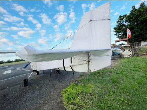
Best Off Skyranger Empennage Cover, test fit cover