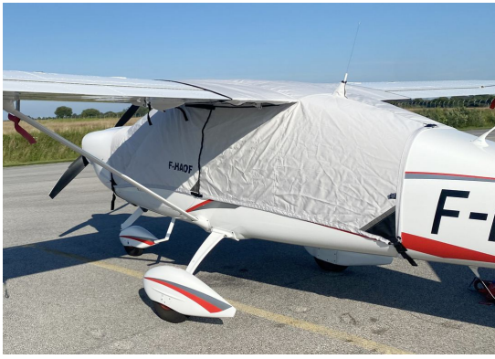
Tecnam P2010 Over-Top Canopy Cover