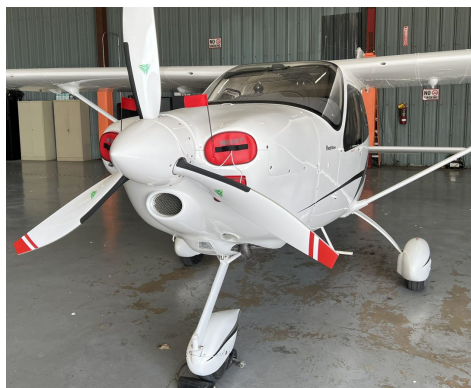
Tecnam P2010 Engine Plugs

Engine Inlet Plugs are custom fit for your Airplane Factory Sling HW intakes, made with heavy-duty vinyl material, and stuffed with a single block of sculpted urethane foam. Each plug has a zipper that allows the foam to be removed and dried if necessary. Engine plugs have warning flags that are visible from the cockpit or 'remove before flight' streamers sewn onto the face of the plugs. Most plugs are imprinted with the aircraft registration number in black for an extra charge. Storage bag NOT included. Engine plugs may be inserted after flight when the engine is still warm. Engine Inlet Plugs are commonly referred to as Cowl Plugs, Intake Plugs, Cowl Blocks, Engine Blocks, and Engine Bungs.