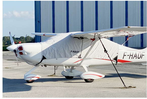
Tecnam P2010 Over-Top Canopy Cover, Engine Plugs