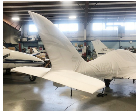
Shark 600 Complete Cover Set, test fit