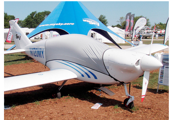
Mysky Fly-Away Travel Cover