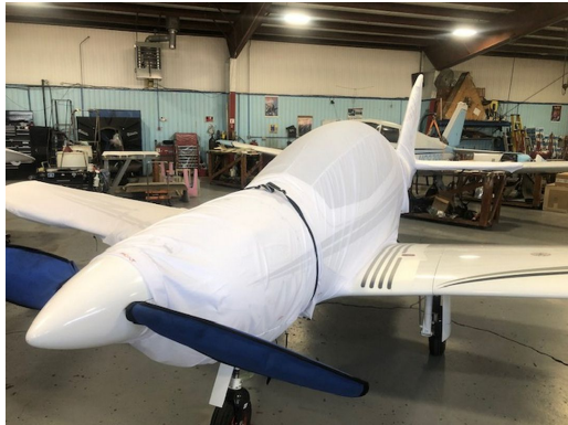
Shark 600 Complete Cover Set, test fit

WINTER USE MATERIAL - Made with Solution-Dyed Polyester fabric, this option is intended for seasonal use to aid in deicing, rain mitigation, or for occasional travel. The material is lighter and more compact, but more susceptible to UV damage and may have a shorter useful life if used continuously outside than the all-year use material.