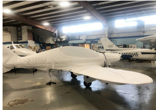
Shark 600 Complete Cover Set, test fit