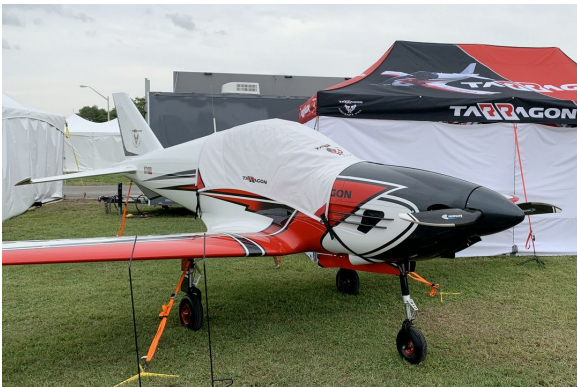
Pelegrin Tarragon Canopy Cover

This cover type is made from Silver Acrylic Sunbrella canvas and is 100% lined with a soft and smooth microfiber. Bruce's Custom Covers developed this material combination especially for aircraft protection. The outer material is medium weight and treated for water resistance, UV resistance and anti-static buildup. The inner lining is a very soft and smooth microfiber to prevent scratching. The material is very reflective, and tests show that the cabin interior temperature can be reduced to near-ambient temperature on the hottest of days. It is water, ice and snow repellent, yet breathable to allow moisture to escape from between the cover and the aircraft surface.