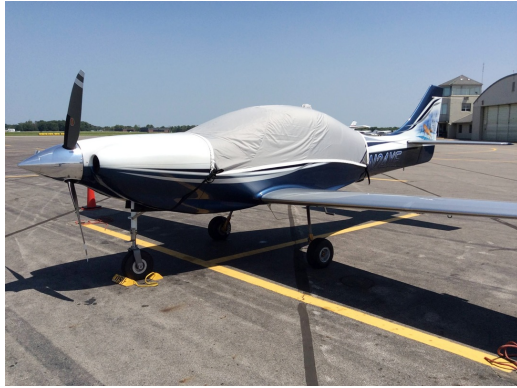
Lancair IV Light Weight Travel Canopy Cover

Travel Covers are made with Silver Solution-Dyed Polyester fabric and only lined over the windshield to save weight. The material is lightweight and more compact for easy stowage in the aircraft. The polyester material is water resistant, but only intended for occasional use outside. We also have an ultra lightweight material available for fitted hangar dust covers. For daily outdoor use, the non-travel Sunbrella Cover is the best choice.