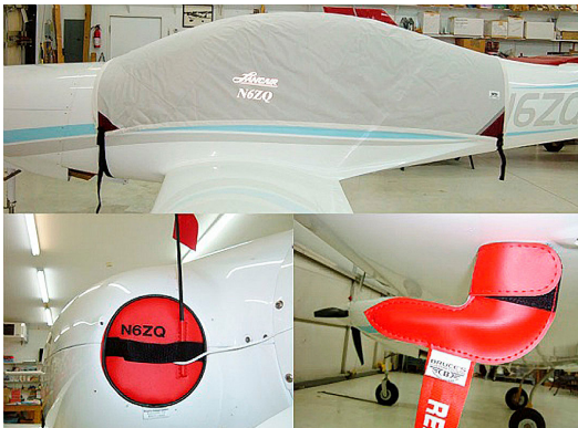
Recommended fly-away kit: Canopy Cover, Engine Inlet Plugs & Pitot Cover

This cover type is made from Silver Acrylic Sunbrella canvas and is 100% lined with a soft and smooth microfiber. Bruce's Custom Covers developed this material combination especially for aircraft protection. The outer material is medium weight and treated for water resistance, UV resistance and anti-static buildup. The inner lining is a very soft and smooth microfiber to prevent scratching. The material is very reflective, and tests show that the cabin interior temperature can be reduced to near-ambient temperature on the hottest of days. It is water, ice and snow repellent, yet breathable to allow moisture to escape from between the cover and the aircraft surface.