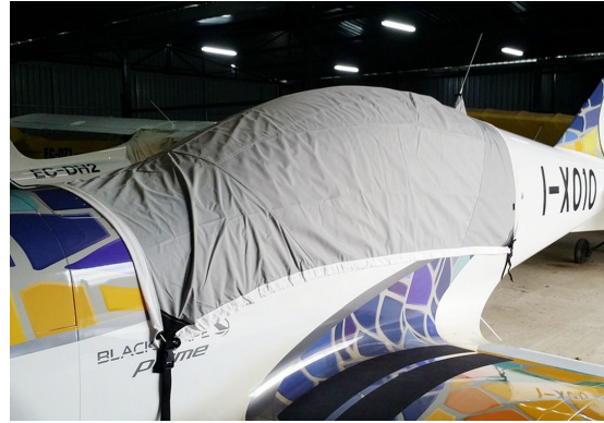
Blackshape Prime Travel Cover, Light Weight Travel Canopy Cover