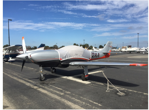
Lancair Legacy 2000 Travel Canopy Cover