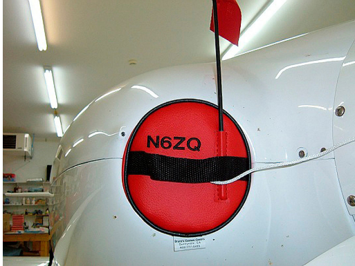
Lancair 320 Engine Inlet Plugs

Engine Inlet Plugs are custom fit for your Shark UL, sportShark, Shark 600 intakes, made with heavy-duty vinyl material, and stuffed with a single block of sculpted urethane foam. Each plug has a zipper that allows the foam to be removed and dried if necessary. Engine plugs have warning flags that are visible from the cockpit or 'remove before flight' streamers sewn onto the face of the plugs. Most plugs are imprinted with the aircraft registration number in black for an extra charge. Storage bag NOT included. Engine plugs may be inserted after flight when the engine is still warm. Engine Inlet Plugs are commonly referred to as Cowl Plugs, Intake Plugs, Cowl Blocks, Engine Blocks, and Engine Bunges.