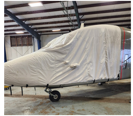
Short Brothers Sherpa, Skyvan, 330 & 360 (C-23) Forward Fuselage/Nose Cover Short Skyvan Forward Fuselage/Nose Cover