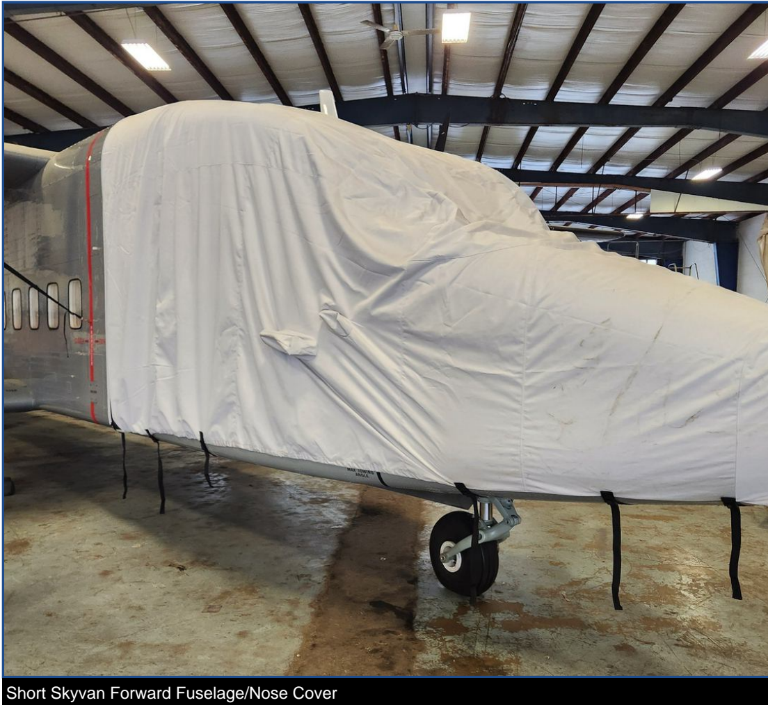
Short Skyvan Forward Fuselage/Nose Cover