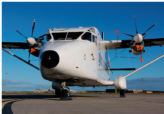
Covers, Plugs & HeatShields for the Short 330/360