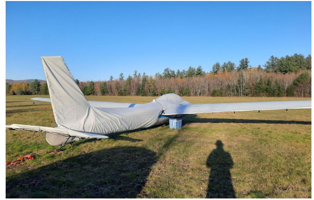
Schweizer 2-32 Full Cover Set