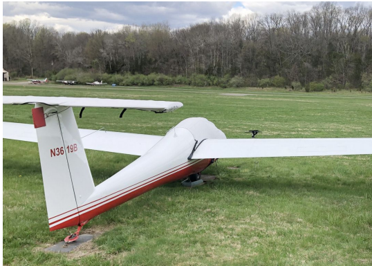
Schweizer 1-36 Canopy & Horiz. Stab. Covers

WINTER USE MATERIAL - Made with Solution-Dyed Polyester fabric, this option is intended for seasonal use to aid in deicing, rain mitigation, or for occasional travel. The material is lighter and more compact, but more susceptible to UV damage and may have a shorter useful life if used continuously outside than the all-year use material.