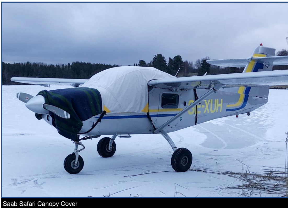
Saab Safari Canopy Cover