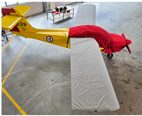
Saab Safari MFI-15, MFI-17 Canopy, Insulated Prop & Engine, Wing Covers