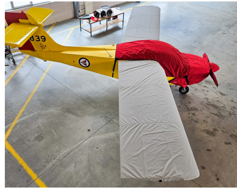
Bolkow Junior 208 Canopy Cover (test fit)