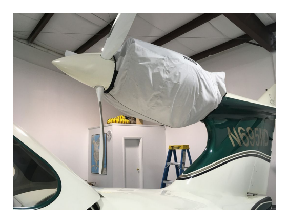
Seawind 3000 Custom Engine Cover