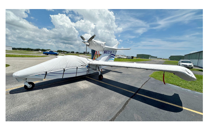
Seawind 3000 Canopy/Nose, Wing & Engine Covers