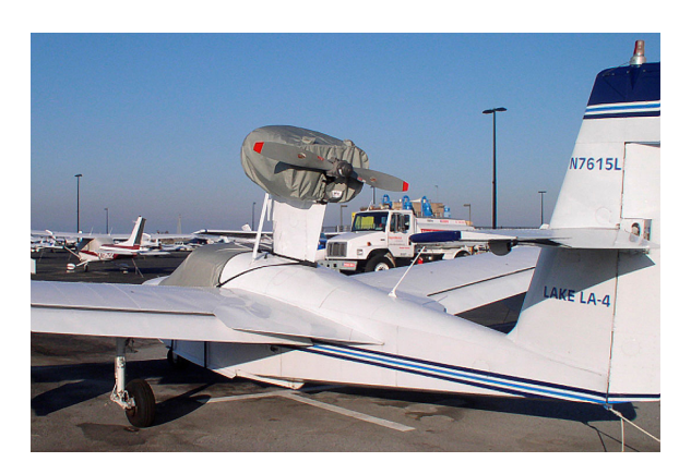
Lake Canopy & Engine Covers

This cover type is made from Silver Acrylic Sunbrella canvas and is 100% lined with a soft and smooth microfiber. Bruce's Custom Covers developed this material combination especially for aircraft protection. The outer material is medium weight and treated for water resistance, UV resistance and anti-static buildup. The inner lining is a very soft and smooth microfiber to prevent scratching. The material is very reflective, and tests show that the cabin interior temperature can be reduced to near-ambient temperature on the hottest of days. It is water, ice and snow repellent, yet breathable to allow moisture to escape from between the cover and the aircraft surface.