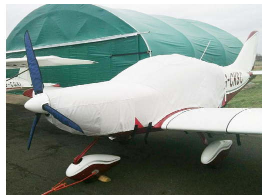
PiperSport Canopy/Engine Cover, Wing Locker Covers