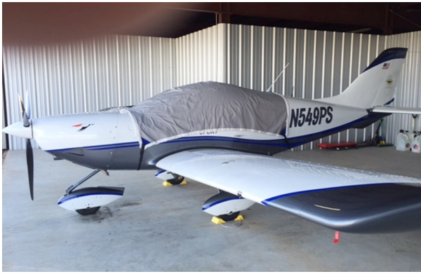
PiperSport Light Weight Travel Cover