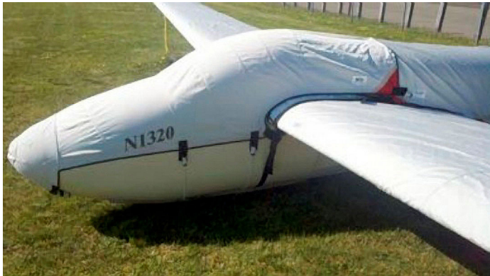
Schweizer SGS 1-26B Canopy/Nose, Wings & Empennage Covers