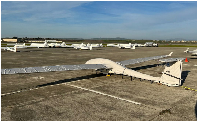
Schempp-Hirth Discus 2B Complete Cover Set