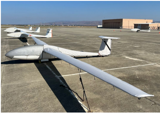
Schempp-Hirth Standard Cirrus Wing & Empennage Covers