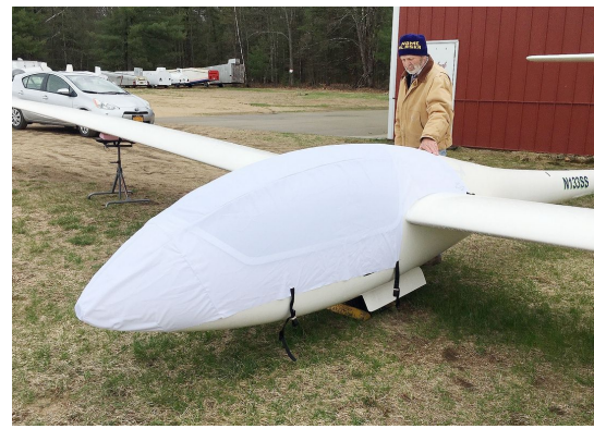
Grob 102 Astir CS Canopy/Nose Cover (test fit)