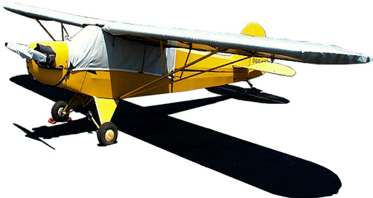
Piper J3 Canopy, Wing and Prop Covers