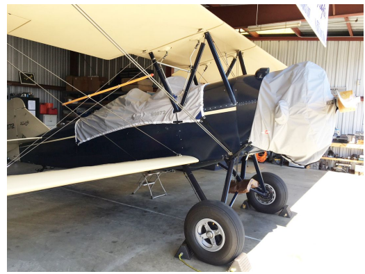
Travel Air 4000 Canopy and Engine Covers, light weight travel type