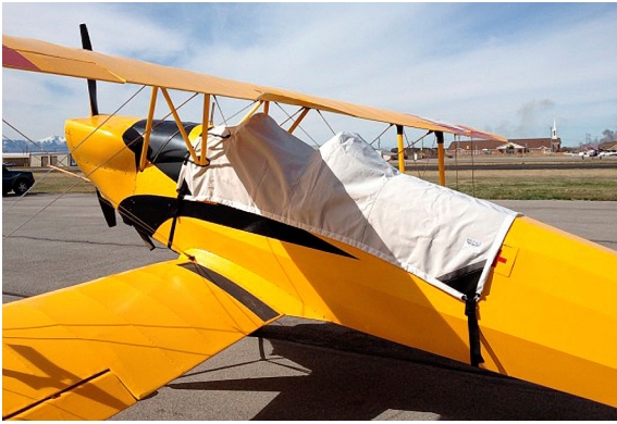
Bucker Jungmann Canopy Cover

the hottest of days. It is water, ice and snow repellent, yet breathable to allow moisture to escape from between the cover and the aircraft surface.