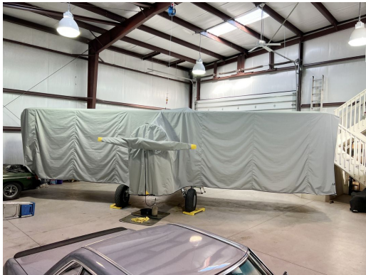
Stearman PT-13 Full Body Dust Cover

Some high value aircraft end up logging lots of hangar time, and become dust magnets in the process. A high quality, well fitting dust cover provides easy assurance that the aircraft's surfaces remain clean and free of grit and grime. Available in a large variety of colors, each dust cover is custom made according to aircraft details and customer preferences. Fire retardant fabrics are also available.