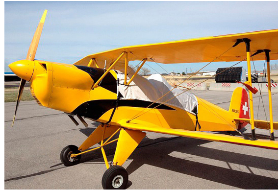
Bucker Jungmann Canopy Cover