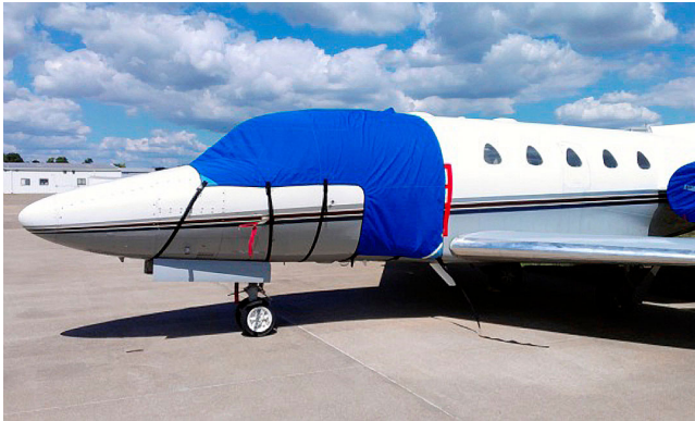
Rockwell Sabre Cockpit/Door Cover

This cover type is made from Silver Acrylic Sunbrella canvas and is 100% lined with a soft and smooth microfiber. Bruce's Custom Covers developed this material combination especially for aircraft protection. The outer material is medium weight and treated for water resistance, UV resistance and anti-static buildup. The inner lining is a very soft and smooth microfiber to prevent scratching. The material is very reflective, and tests show that the cabin interior temperature can be reduced to near-ambient temperature on the hottest of days. It is water, ice and snow repellent, yet breathable to allow moisture to escape from between the cover and the aircraft surface.