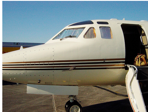
Sabre Cockpit HeatShields Set

Heatshields are interior sunshades for an aircraft's windows or canopy glass. The product is a unique composite of closed-cell foam with a silver mylar finish. The semi-rigid design is stiff enough to stand along the inside of the windshield using sun visors or window framing. It folds up flat and easily stores in the included storage sleeve. Some designs may require velcro and suction cups. A Heatshield is an excellent short-term remedy for cockpit overheating.