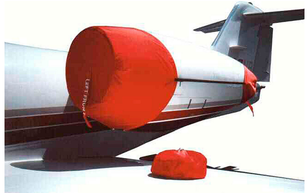
Lear 30 Tri-Fold Engine Cover