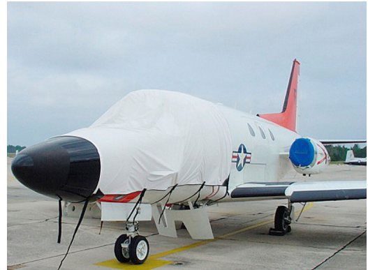
Sabre 40 Cockpit and Engine Covers set