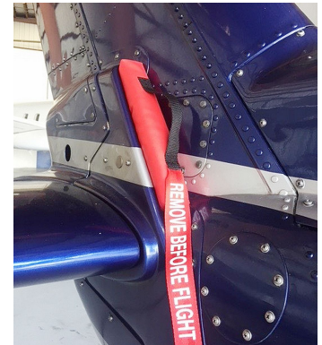
S76 Tail Wedge Plug