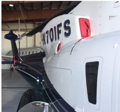
Sikorsky S76 (All Models) Intake Plugs (S76c Models)

The Engine Inlet Plugs are custom fit for your Sikorsky S76 (All Models) intakes, made with heavy-duty vinyl material, and stuffed with a single block of sculpted urethane foam. Each plug has a zipper that allows the foam to be removed and dried if necessary. Engine plugs have 'Remove Before Flight' streamers sewn onto the face of the plugs. Most plugs are imprinted with the aircraft registration number in black for an extra charge. Storage bag NOT included. Engine plugs may be inserted after flight when the engine is still warm. Engine Inlet Plugs are commonly referred to as Cowl Plugs, Intake Plugs, Cowl Blocks, Engine Blocks, and Engine Bungs.