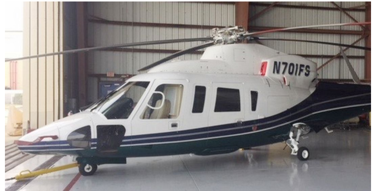
Sikorsky S76 (All Models) Intake Plugs (S76c Models)