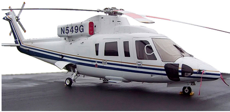
Sikorsky S76 Snap-On Windshield Cover