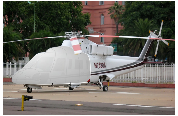
Sikorsky S76 Bubble Cover (Forward Canopy Cover)