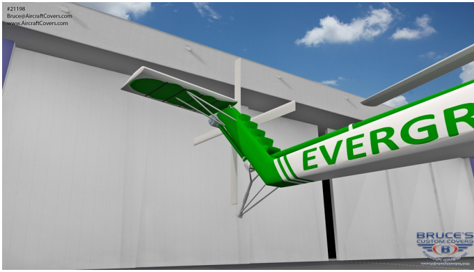
Sikorsky S-64 Canopy/Nose, Engine Area, Blade, Rotor, Tail Rotor Sikorsky S-64 Skycrane, CH-54 Tarhe Insulated Engine, Rotor Hub, Tailboom, Stabilizer & Tail Rotor Covers (illustration)