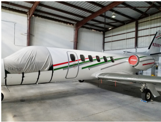
Cessna Citation II Cockpit Cover, Wing Covers

WINTER USE MATERIAL - Made with Solution-Dyed Polyester fabric, this option is intended for seasonal use to aid in deicing, rain mitigation, or for occasional travel. The material is lighter and more compact, but more susceptible to UV damage and may have a shorter useful life if used continuously outside than the all-year use material.