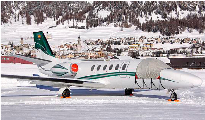
Cessna Citation 550 Windshield Cover