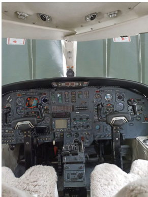
Cessna Citation I & II Cockpit HeatShields