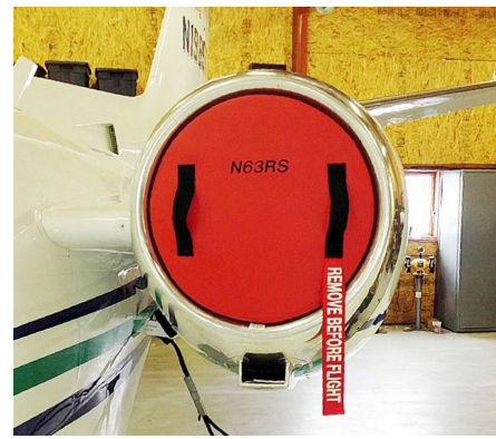
Cessna Citation S-550 Intake Plugs