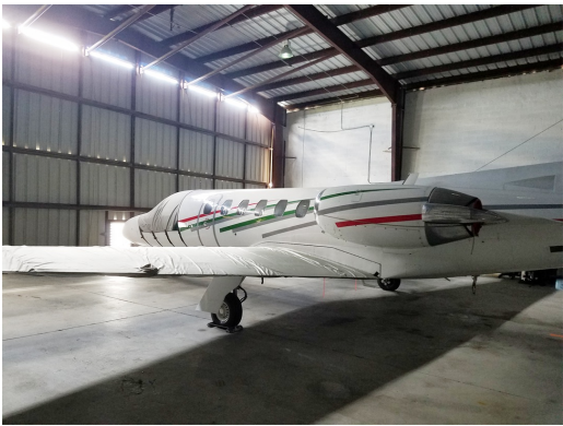
Cessna Citation II Cockpit Cover, Wing Covers