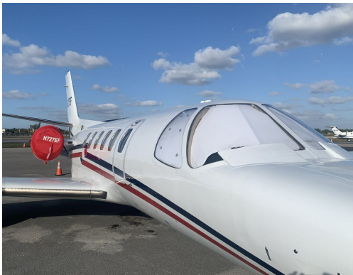
Cessna Citation S550

Custom-made Heatshield Sunshades are available for almost any window in the jet. Side windows, Skylights, and Emergency Exits are all custom-made. The product is a unique composite of closed-cell foam with a silver mylar finish. The set is easily stored in the included storage sleeve. Some designs may require velcro and suction cups. Our Heatshields are offered white side out since aircraft manufacturers have issued advisories against reflective window inserts due to potential heat damage.