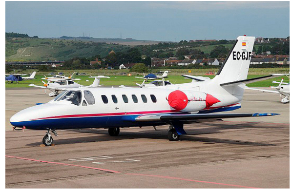
Cessna Citation "Bikini" Type Engine Covers: Extremely Light & Portable