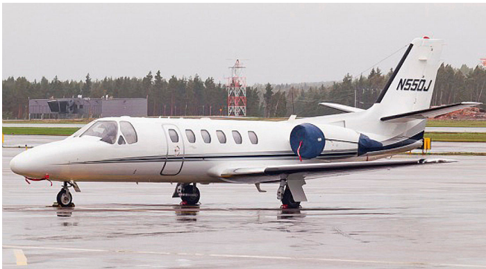
Cessna Citation Bravo Engine Covers and Pitot Covers sets

and dried if necessary. Engine plugs have 'remove before flight' streamers sewn onto the face of the plugs. Most plugs are imprinted with the aircraft registration number in black. Engine plugs may be inserted after flight when the engine is still warm. Engine Inlet Plugs are commonly referred to as Cowl Plugs, Intake Plugs, Cowl Blocks, Engine Blocks, and Engine Bungs.