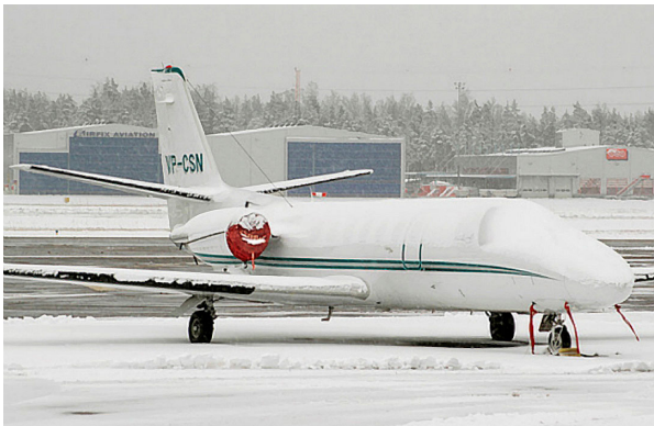
Cessna 560 Engine Inlet/Exhaust Covers, Pitot Cover Set