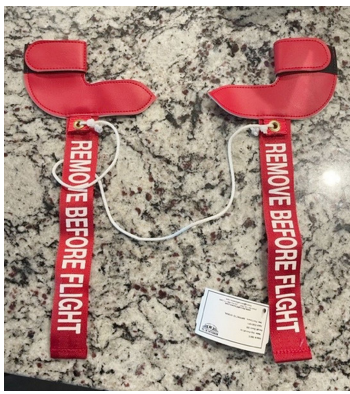
Cessna Citation Pitot Cover Set