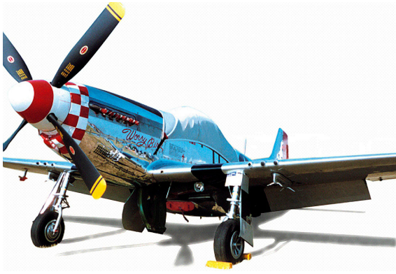
Canopy Cover, Belly & Chin Scoop Plugs

Covers developed this material combination especially for aircraft protection. The outer material is medium weight and treated for water resistance, UV resistance and anti-static buildup. The inner lining is a very soft and smooth microfiber to prevent scratching. The material is very reflective, and tests show that the cabin interior temperature can be reduced to near-ambient temperature on the hottest of days. It is water, ice and snow repellent, yet breathable to allow moisture to escape from between the cover and the aircraft surface.