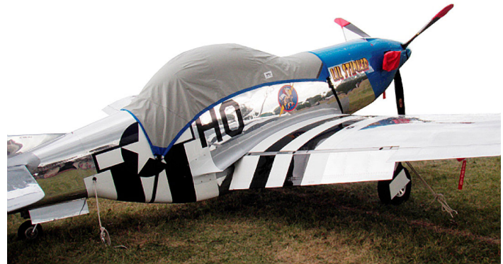
Stewart Mustang Canopy Cover, Prop Tie Downs & Intake Plugs