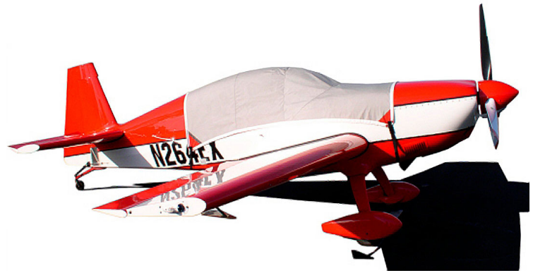
Canopy Cover for the Extra 300