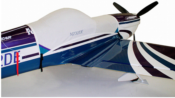
Cap 232 Canopy Cover