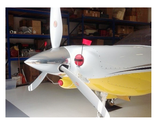
Swearingen SX300 Engine Inlet Plugs