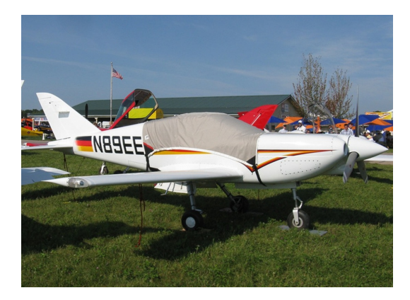
The Sweringen SX300 Canopy Cover