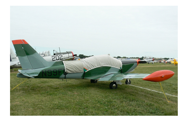
Siai Marchetti SF260 Canopy Cover with aft extension