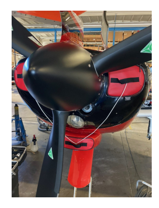
Siai Marchetti SF260 Engine Plugs

Engine Inlet Plugs are custom fit for your Siai Marchetti SF260 intakes, made with heavy-duty vinyl material, and stuffed with a single block of sculpted urethane foam. Each plug has a zipper that allows the foam to be removed and dried if necessary. Engine plugs have warning flags that are visible from the cockpit or 'remove before flight' streamers sewn onto the face of the plugs. Most plugs are imprinted with the aircraft registration number in black for an extra charge. Storage bag NOT included. Engine plugs may be inserted after flight when the engine is still warm. Engine Inlet Plugs are commonly referred to as Cowl Plugs, Intake Plugs, Cowl Blocks, Engine Blocks, and Engine Bungs.