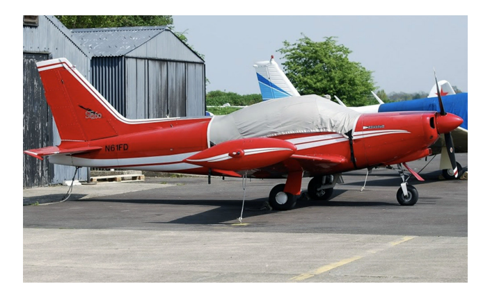
Siai Marchetti SF260 Canopy Cover

This cover type is made from Silver Acrylic Sunbrella canvas and is 100% lined with a soft and smooth microfiber. Bruce's Custom Covers developed this material combination especially for aircraft protection. The outer material is medium weight and treated for water resistance, UV resistance and anti-static buildup. The inner lining is a very soft and smooth microfiber to prevent scratching. The material is very reflective, and tests show that the cabin interior temperature can be reduced to near-ambient temperature on the hottest of days. It is water, ice and snow repellent, yet breathable to allow moisture to escape from between the cover and the aircraft surface.