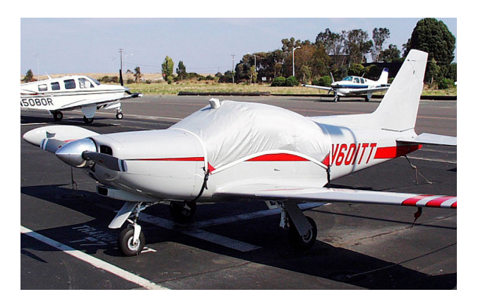
Standard Canopy Cover for Marchetti SF260