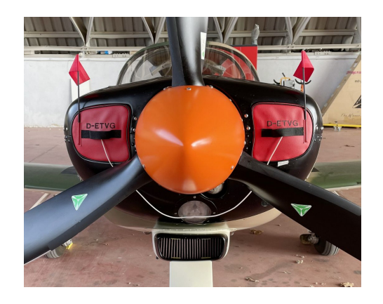
Marcheti SF260C Inlet Plugs