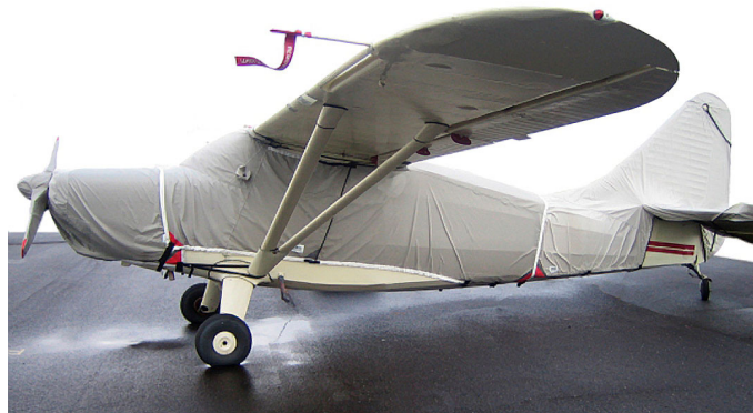
Stinson 108 Canopy, Engine, Prop & Empennage Covers

Stinson S-10 & S-10A Models Pitot Tube Covers , NOT HEAT RESISTANT TYPE, are made of Naugahyde vinyl, and are designed to cover the entire pitot assembly. Slipping over the tube, the cover tightens around the base with a Velcro strap detail. A "Remove Before Flight" streamer is attached to the cover. Heat Resistant Pitot Covers are an upgrade to this design, and help prevent the pitot cover from melting onto the tube if the pitot heat is accidentally turned on while installed. If you want the set tethered together, please let us know.