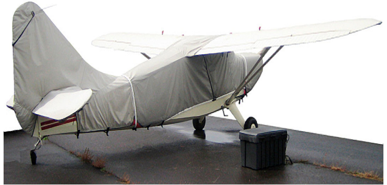
Stinson 108 Canopy, Engine, Prop & Empennage Covers