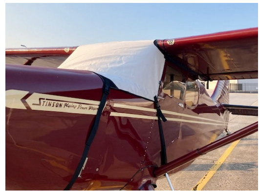
Stinson 108 Windshield Cover