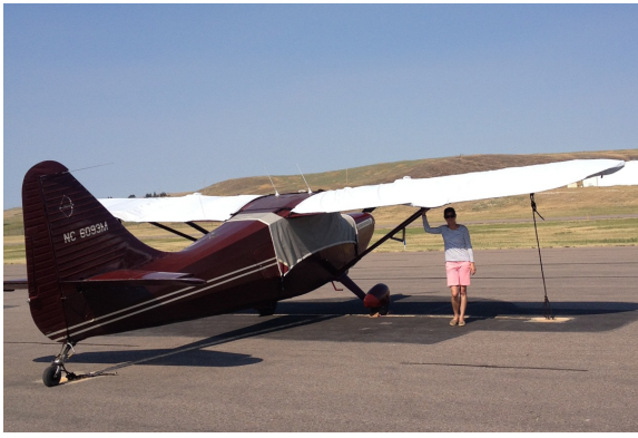
Stinson 108 Canopy Cover & Wing Covers