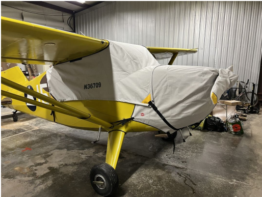
Stinson 10 Canopy, Engine & Prop Covers

This cover type is made from Silver Acrylic Sunbrella canvas and is 100% lined with a soft and smooth microfiber. Bruce's Custom Covers developed this material combination especially for aircraft protection. The outer material is medium weight and treated for water resistance, UV resistance and anti-static buildup. The inner lining is a very soft and smooth microfiber to prevent scratching. The material is very reflective, and tests show that the cabin interior temperature can be reduced to near-ambient temperature on the hottest of days. It is water, ice and snow repellent, yet breathable to allow moisture to escape from between the cover and the aircraft surface.