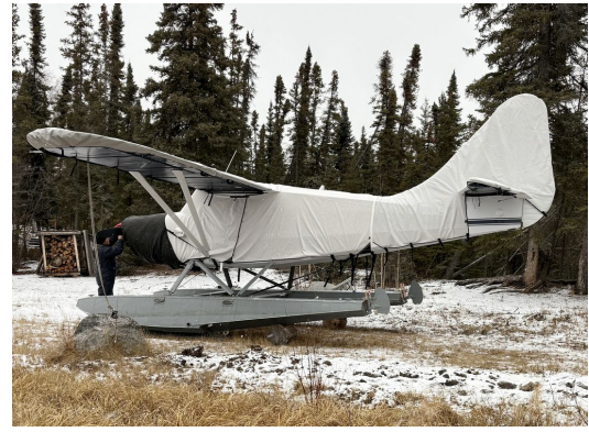
Stinson 108 Cover Set