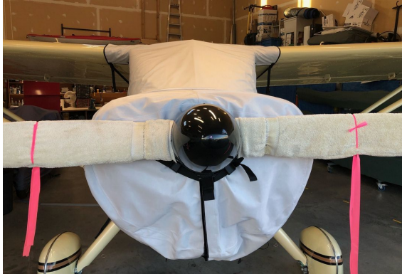
Stinson 108 Over-Top Canopy Cover, Engine Cover

This cover type is made from Silver Acrylic Sunbrella canvas and is 100% lined with a soft and smooth microfiber. Bruce's Custom Covers developed this material combination especially for aircraft protection. The outer material is medium weight and treated for water resistance, UV resistance and anti-static buildup. The inner lining is a very soft and smooth microfiber to prevent scratching. The material is very reflective, and tests show that the cabin interior temperature can be reduced to near-ambient temperature on the hottest of days. It is water, ice and snow repellent, yet breathable to allow moisture to escape from between the cover and the aircraft surface.