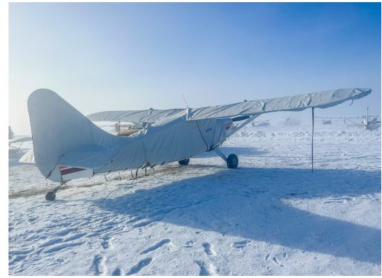
Stinson 108 Winter Cover Set