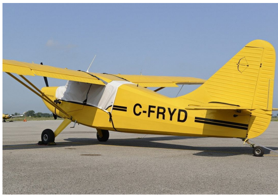
Stinson 108 Voyager Canopy Cover, Wrap-Around Type