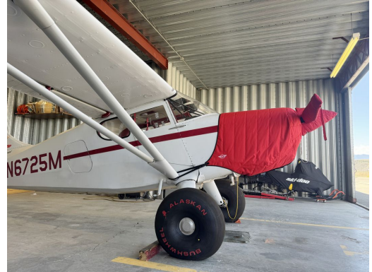
Stinson 108-3 Insulated Engine Cover