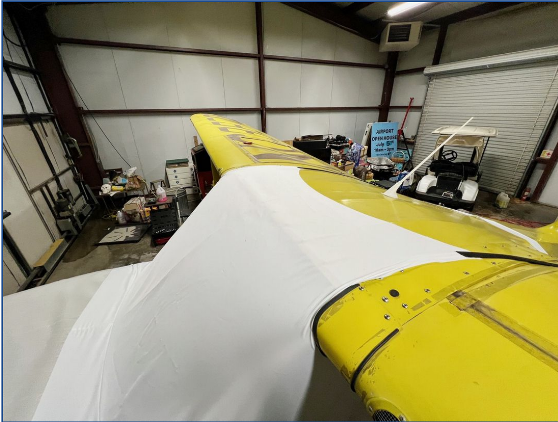
Stinson Model 10 Canopy Cover, test fit cover