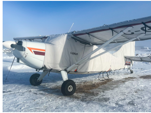
Stinson 108 Canopy, Engine, Prop & Empennage Covers Stinson 108 Voyager Extended Canopy, Wing & Empennage Covers.