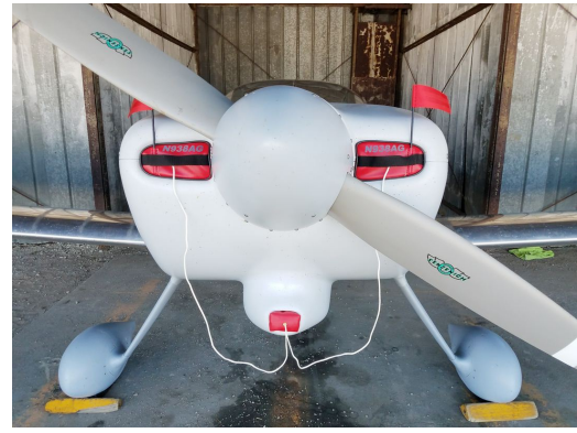
Van's RV-9 Engine Inlet Plugs