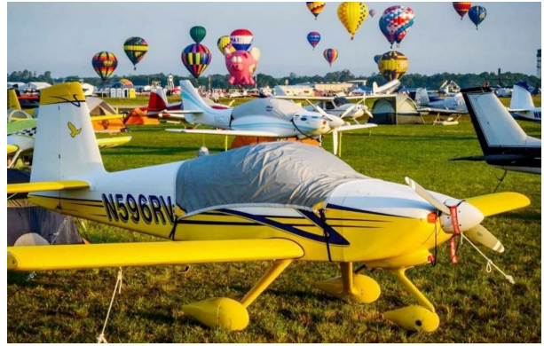
Vans's RV-9 Travel Weight Canopy Cover at Sun 'n Fun