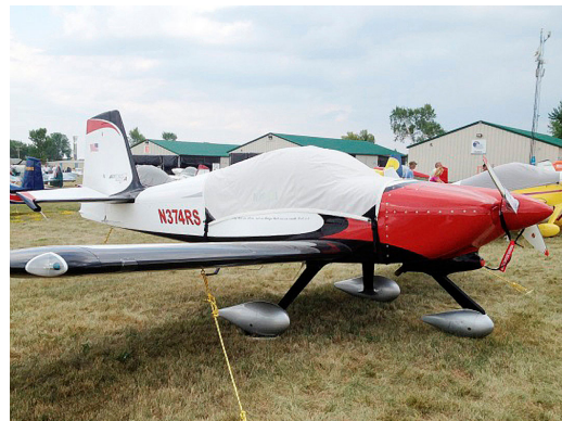
Van's RV-9 Canopy Cover