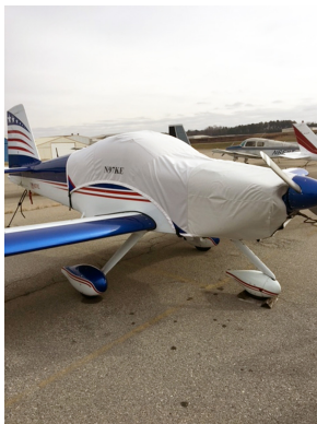
Van's RV-9 Canopy Engine Cover

This cover type is made from Silver Acrylic Sunbrella canvas and is 100% lined with a soft and smooth microfiber. Bruce's Custom Covers developed this material combination especially for aircraft protection. The outer material is medium weight and treated for water resistance, UV resistance and anti-static buildup. The inner lining is a very soft and smooth microfiber to prevent scratching. The material is very reflective, and tests show that the cabin interior temperature can be reduced to near-ambient temperature on the hottest of days. It is water, ice and snow repellent, yet breathable to allow moisture to escape from between the cover and the aircraft surface.