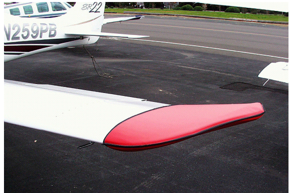
Cirrus SR-22 Wingtip Pad (also available for the Horiz. Stab.)