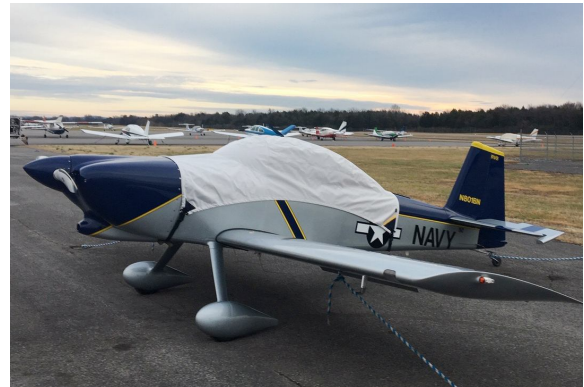
Van's RV-8 Canopy Cover