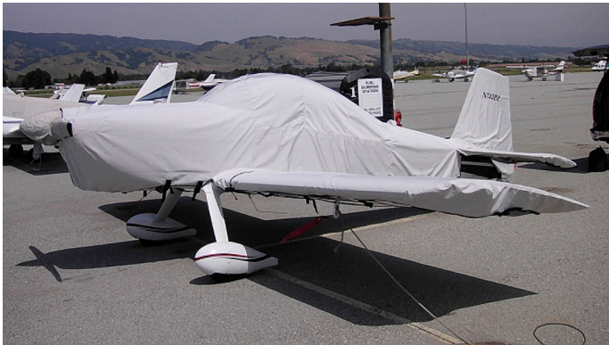
Van's RV-8 Complete Fuselage Cover w/ Detachable Wing Covers & Prop Cover

This cover type is made from Silver Acrylic Sunbrella canvas and is 100% lined with a soft and smooth microfiber. Bruce's Custom Covers developed this material combination especially for aircraft protection. The outer material is medium weight and treated for water resistance, UV resistance and anti-static buildup. The inner lining is a very soft and smooth microfiber to prevent scratching. The material is very reflective, and tests show that the cabin interior temperature can be reduced to near-ambient temperature on the hottest of days. It is water, ice and snow repellent, yet breathable to allow moisture to escape from between the cover and the aircraft surface.