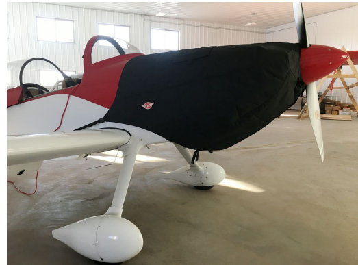
Van's RV-8 Insulated Engine Cover