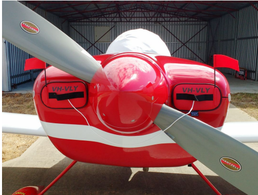
Van's RV-8 Engine Inlet Plugs

Engine Inlet Plugs are custom fit for your Van's Aircraft RV-8/8A intakes, made with heavy-duty vinyl material, and stuffed with a single block of sculpted urethane foam. Each plug has a zipper that allows the foam to be removed and dried if necessary. Engine plugs have warning flags that are visible from the cockpit or 'remove before flight' streamers sewn onto the face of the plugs. Most plugs are imprinted with the aircraft registration number in black for an extra charge. Storage bag NOT included. Engine plugs may be inserted after flight when the engine is still warm. Engine Inlet Plugs are commonly referred to as Cowl Plugs, Intake Plugs, Cowl Blocks, Engine Blocks, and Engine Bungs.