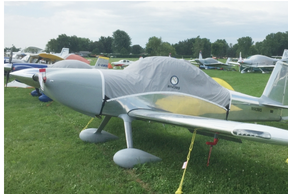
Van's Aircraft RV-8 Travel Cover, Light Weight Travel Canopy Cover