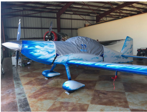
Van's RV-8 Fastback Travel Canopy Cover

Travel Covers are made with Silver Solution-Dyed Polyester fabric and only lined over the windshield to save weight. The material is lightweight and more compact for easy stowage in the aircraft. The polyester material is water resistant, but only intended for occasional use outside. We also have an ultra lightweight material available for fitted hangar dust covers. For daily outdoor use, the non-travel Sunbrella Cover is the best choice.