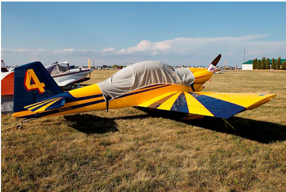
Van's RV-8 Canopy Cover

This cover type is made from Silver Acrylic Sunbrella canvas and is 100% lined with a soft and smooth microfiber. Bruce's Custom Covers developed this material combination especially for aircraft protection. The outer material is medium weight and treated for water resistance, UV resistance and anti-static buildup. The inner lining is a very soft and smooth microfiber to prevent scratching. The material is very reflective, and tests show that the cabin interior temperature can be reduced to near-ambient temperature on the hottest of days. It is water, ice and snow repellent, yet breathable to allow moisture to escape from between the cover and the aircraft surface.