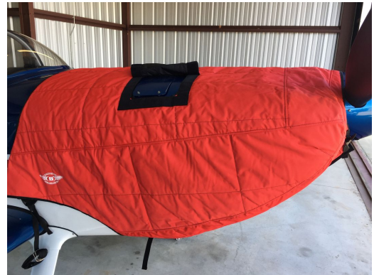
Van's RV-8 Insulated Engine Cover with Oil Filler Preheater access flap