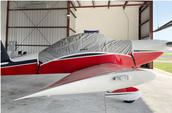
Van's RV-8 Travel Weight Canopy Cover

Travel Covers are made with Silver Solution-Dyed Polyester fabric and only lined over the windshield to save weight. The material is lightweight and more compact for easy stowage in the aircraft. The polyester material is water resistant, but only intended for occasional use outside. We also have an ultra lightweight material available for fitted hangar dust covers. For daily outdoor use, the non-travel Sunbrella Cover is the best choice.