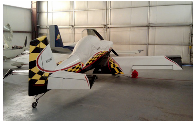
Van's Aircraft RV-8/8A Canopy Cover, Belly Strap Type (Extends To Cover Baggage Door)