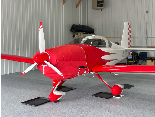
Van's RV-9A Insulated Engine Cover with oil door access

This cover type is made from Silver Acrylic Sunbrella canvas and is 100% lined with a soft and smooth microfiber. Bruce's Custom Covers developed this material combination especially for aircraft protection. The outer material is medium weight and treated for water resistance, UV resistance and anti-static buildup. The inner lining is a very soft and smooth microfiber to prevent scratching. The material is very reflective, and tests show that the cabin interior temperature can be reduced to near-ambient temperature on the hottest of days. It is water, ice and snow repellent, yet breathable to allow moisture to escape from between the cover and the aircraft surface.