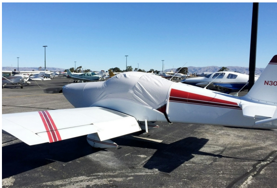
Van's RV-6A Canopy/Engine Cover

This cover type is made from Silver Acrylic Sunbrella canvas and is 100% lined with a soft and smooth microfiber. Bruce's Custom Covers developed this material combination especially for aircraft protection. The outer material is medium weight and treated for water resistance, UV resistance and anti-static buildup. The inner lining is a very soft and smooth microfiber to prevent scratching. The material is very reflective, and tests show that the cabin interior temperature can be reduced to near-ambient temperature on the hottest of days. It is water, ice and snow repellent, yet breathable to allow moisture to escape from between the cover and the aircraft surface.