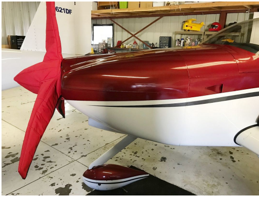
Van's RV-9 Insulated Prop Cover, 3-blade