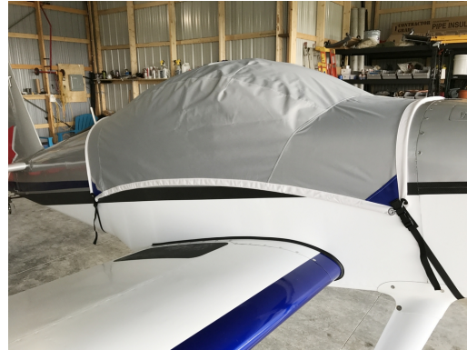
Van's Aircraft RV-9 Travel Cover, Light Weight Travel Canopy Cover