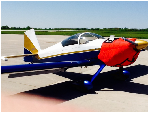
Van's RV-7 Insulated Engine Cover