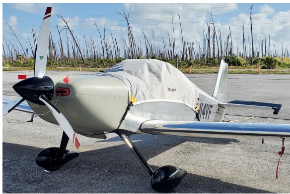
Van's RV-7 Canopy Cover, Engine Plugs