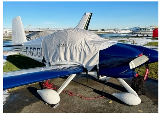
Van's RV-7A extended canopy cover