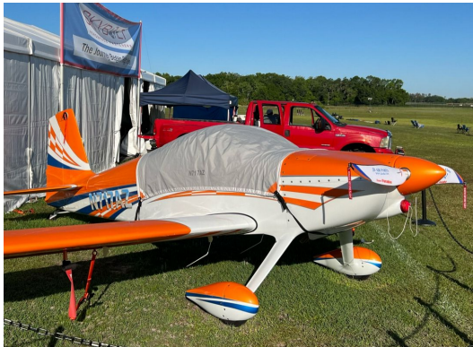
Van's RV-7 Travel Weight Canopy Cover

Travel Covers are made with Silver Solution-Dyed Polyester fabric and only lined over the windshield to save weight. The material is lightweight and more compact for easy stowage in the aircraft. The polyester material is water resistant, but only intended for occasional use outside. We also have an ultra lightweight material available for fitted hangar dust covers. For daily outdoor use, the non-travel Sunbrella Cover is the best choice.