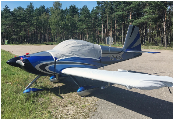
Van's RV-7/7A Travel and Wing Covers

WINTER USE MATERIAL - Made with Solution-Dyed Polyester fabric, this option is intended for seasonal use to aid in deicing, rain mitigation, or for occasional travel. The material is lighter and more compact, but more susceptible to UV damage and may have a shorter useful life if used continuously outside than the all-year use material.