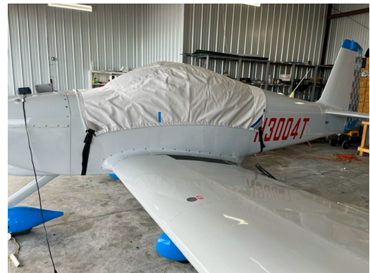
Van's RV-7 Canopy Cover