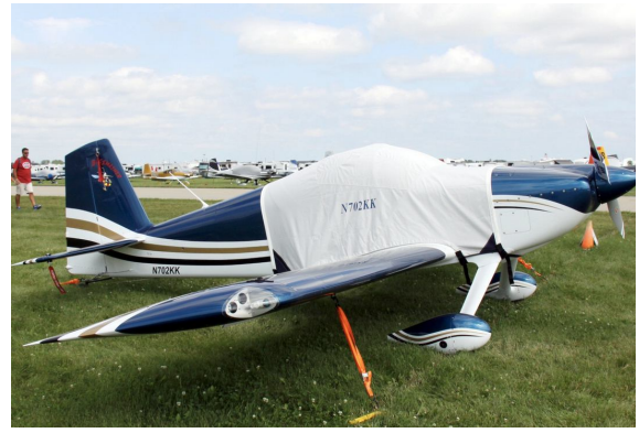
Van's RV-7 Extended Canopy Cover