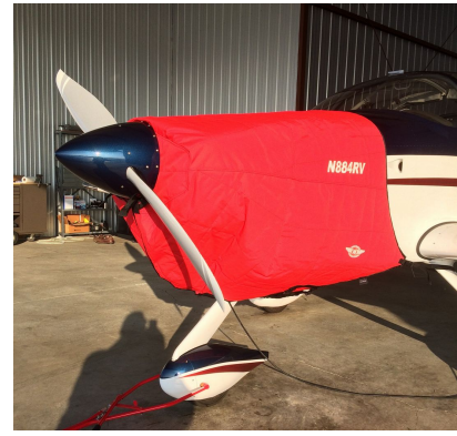
Van's RV-9A Insulated Engine Cover