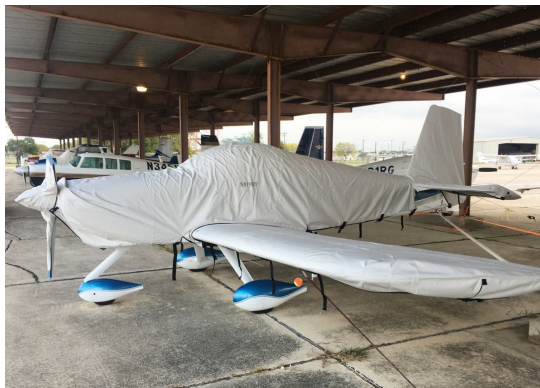
Van's RV-7A Complete Cover Set

This cover type is made from Silver Acrylic Sunbrella canvas and is 100% lined with a soft and smooth microfiber. Bruce's Custom Covers developed this material combination especially for aircraft protection. The outer material is medium weight and treated for water resistance, UV resistance and anti-static buildup. The inner lining is a very soft and smooth microfiber to prevent scratching. The material is very reflective, and tests show that the cabin interior temperature can be reduced to near-ambient temperature on the hottest of days. It is water, ice and snow repellent, yet breathable to allow moisture to escape from between the cover and the aircraft surface.