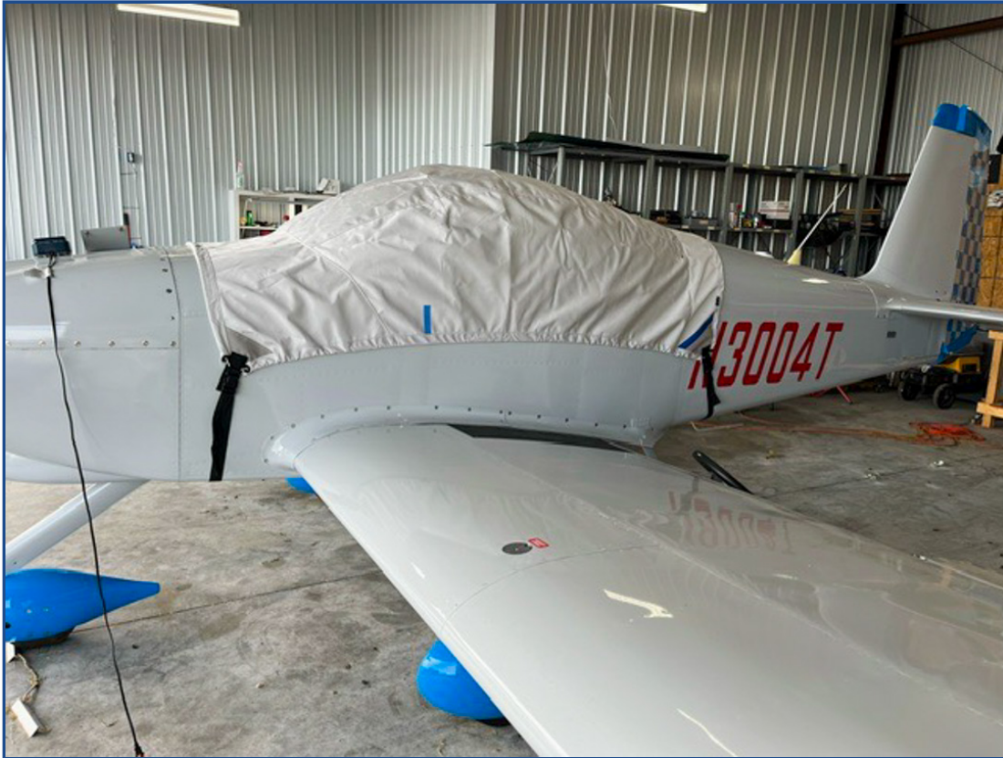
Van's RV-7 Canopy Cover