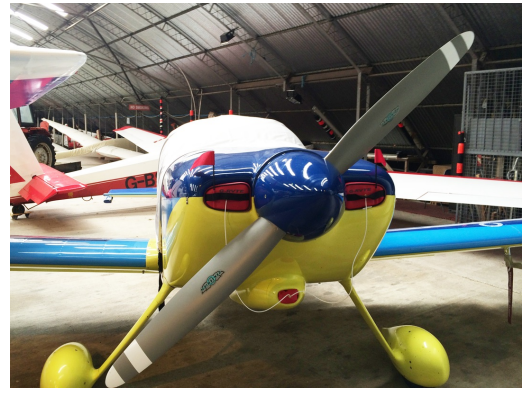
Van's RV-6 Engine Inlet Plugs