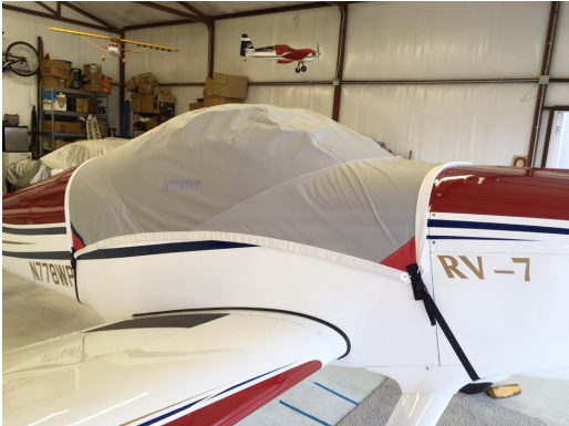
Van's RV-7 Travel Canopy Cover

Travel Covers are made with Silver Solution-Dyed Polyester fabric and only lined over the windshield to save weight. The material is lightweight and more compact for easy stowage in the aircraft. The polyester material is water resistant, but only intended for occasional use outside. We also have an ultra lightweight material available for fitted hangar dust covers. For daily outdoor use, the non-travel Sunbrella Cover is the best choice.