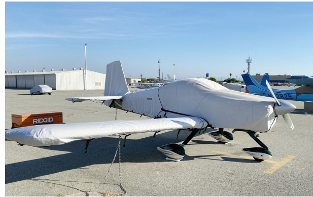
Van's RV-9A Extended Canopy/Engine, Wing & Empennage Covers