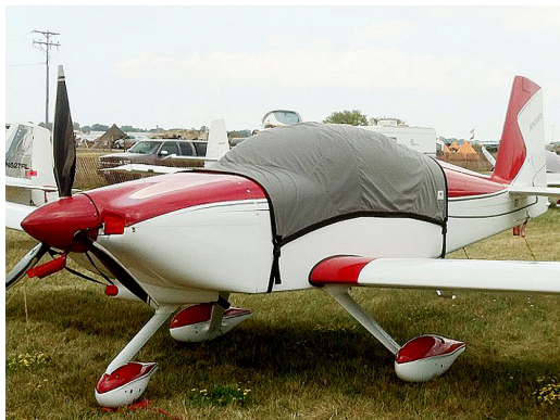
Van's RV-9 Travel Canopy Cover

Travel Covers are made with Silver Solution-Dyed Polyester fabric and only lined over the windshield to save weight. The material is lightweight and more compact for easy stowage in the aircraft. The polyester material is water resistant, but only intended for occasional use outside. We also have an ultra lightweight material available for fitted hangar dust covers. For daily outdoor use, the non-travel Sunbrella Cover is the best choice.