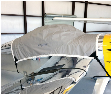
Van's RV-7 Lightweight Travel Canopy Cover