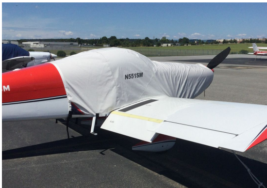
Van's RV-6A Extended Canopy/Engine Cover

This cover type is made from Silver Acrylic Sunbrella canvas and is 100% lined with a soft and smooth microfiber. Bruce's Custom Covers developed this material combination especially for aircraft protection. The outer material is medium weight and treated for water resistance, UV resistance and anti-static buildup. The inner lining is a very soft and smooth microfiber to prevent scratching. The material is very reflective, and tests show that the cabin interior temperature can be reduced to near-ambient temperature on the hottest of days. It is water, ice and snow repellent, yet breathable to allow moisture to escape from between the cover and the aircraft surface.