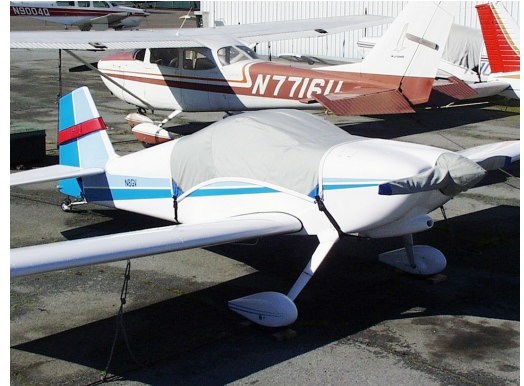
Vans's RV-6 Canopy Cover, Prop Cover