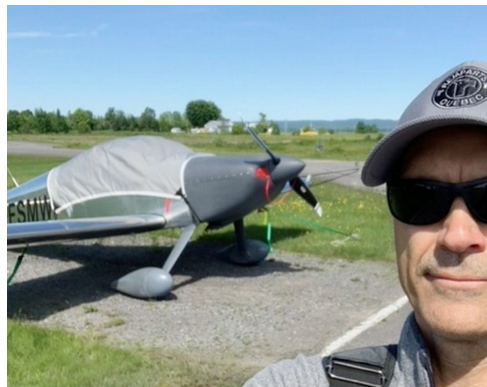
Van's RV-7 Travel Cover, Light Weight Canopy Cover