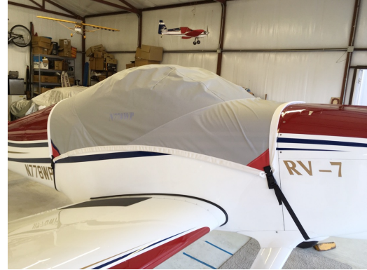
Van's RV-7 Travel Canopy Cover