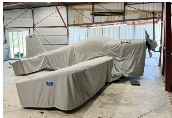
Van's Aircraft RV-7 Hangar Use Dust Cover