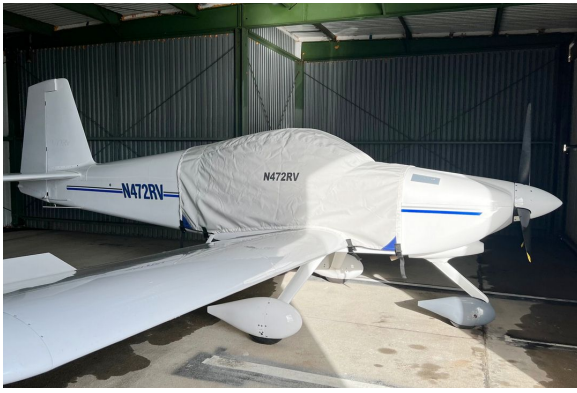
Van's RV-9A Extended Canopy Cover