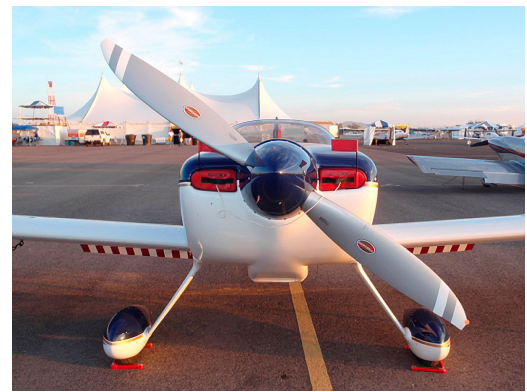
Van's RV-7 Engine Inlet Plugs