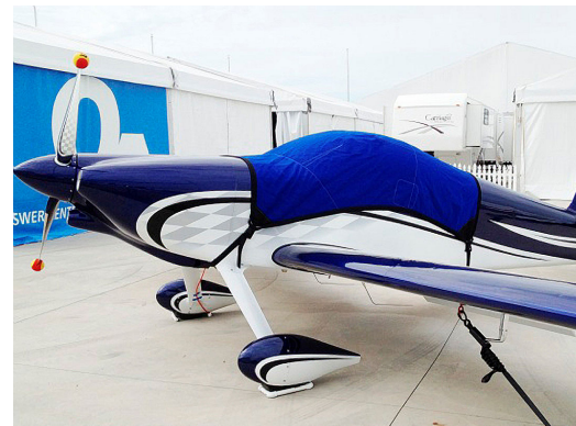
Van's RV-7 Canopy Cover